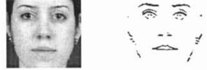
Figure 2: (a)Original image (b)Horizontal edge map

Left and right contours of a face can be detected using horizontal projection while the vertical projection can be used to detect hair-line, nose base and mouth. As the initial step, the vertical locations of nose and mouth in the image with respect to known eye positions are roughly estimated. A refined estimate is then calculated by applying horizontal projection to the edge map (vertical gradient) of the image. The peaks evaluated from the horizontal projection are used to determine the nose base and mouth locations. The retrieved locations are then rated based on their prominence and locations within the estimated range. Figure 2 illustrates examples of the original