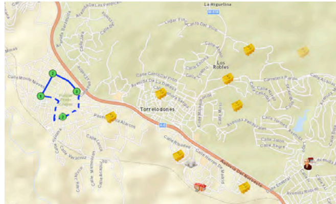
Figure 4. Overlapped comparison of two different alternatives

As a way of complementing the exploration of alternatives, the underlying reasoning of each alternative is captured through annotations and integrated within the plan itself (R4). Planners are able to add annotations linked to specific positions of the map to highlight something relevant in the map, linked to resources to leave knowledge about an specific decision, and linked to an alternative for arguing about a decision. Such annotations can be added by typing or by recording the voice and will store relevant information for the process: the participant that made the annotation, the date in which such annotation was made, and the content of the annotation. Figure 5 shows a screenshot of the widget for annotating the plan.