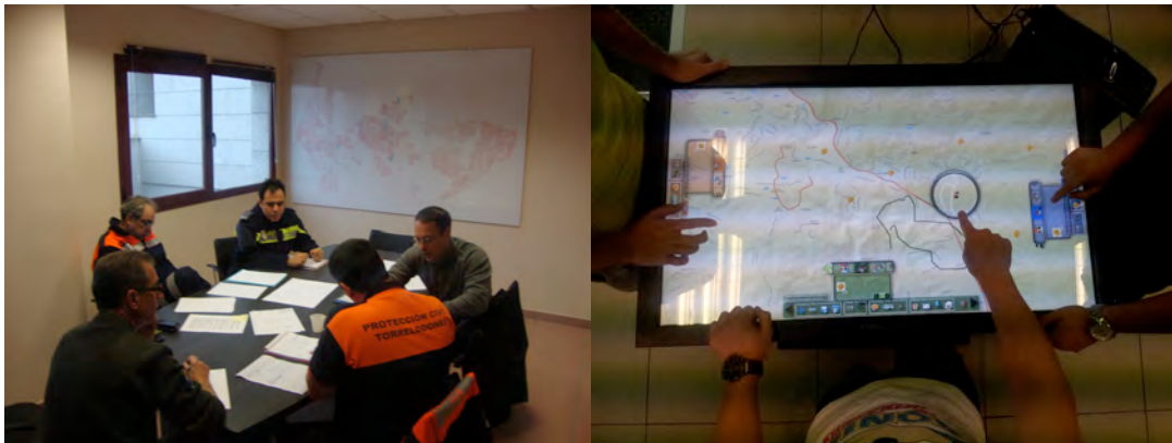
Figure 1. Horizontal orientation for around-the-table interaction: Left – Common planning meeting / Right – Planning meeting performed by using a horizontal touch screen.

Since emergency planning is usually performed as a co-located collaborative activity, TIPEXtop has been designed to be deployed on a horizontally placed touch screen (R2). Horizontal orientation has been highly recognized as the most convenient disposition to support collaborative decision-making activities (Mahyar, Sarvhad, and Tory, 2012; Rogers and Lindley, 2004). In the particular case of our solution, the horizontal disposition of the screen does not only ease and foster discussion among planning team members, but also allows them to maintain their common way of interacting (G3). When planners start a session for defining strategies, they usually gather around a table. Using the horizontal touch screen, as shown in figure 1, planners can be similarly positioned around the screen simulating a physical table.