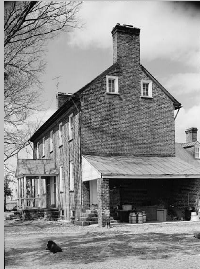
Main House, Green Hill plantation, Virginia, construction on rear wing begun in 1797; two-story front section erected later (photographs, 1960).

. . . Pannill's Big House, although built of brick, was only an I-house, the commonplace residence of a middle-class yeoman.