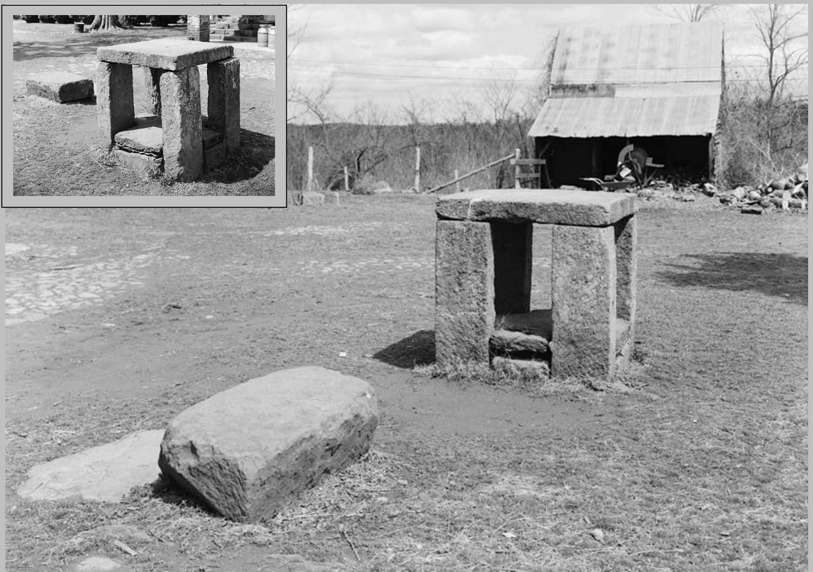
Slave auction area: auctioneer's stand and table for displaying slaves, Green Hill Plantation, Virginia, 1960