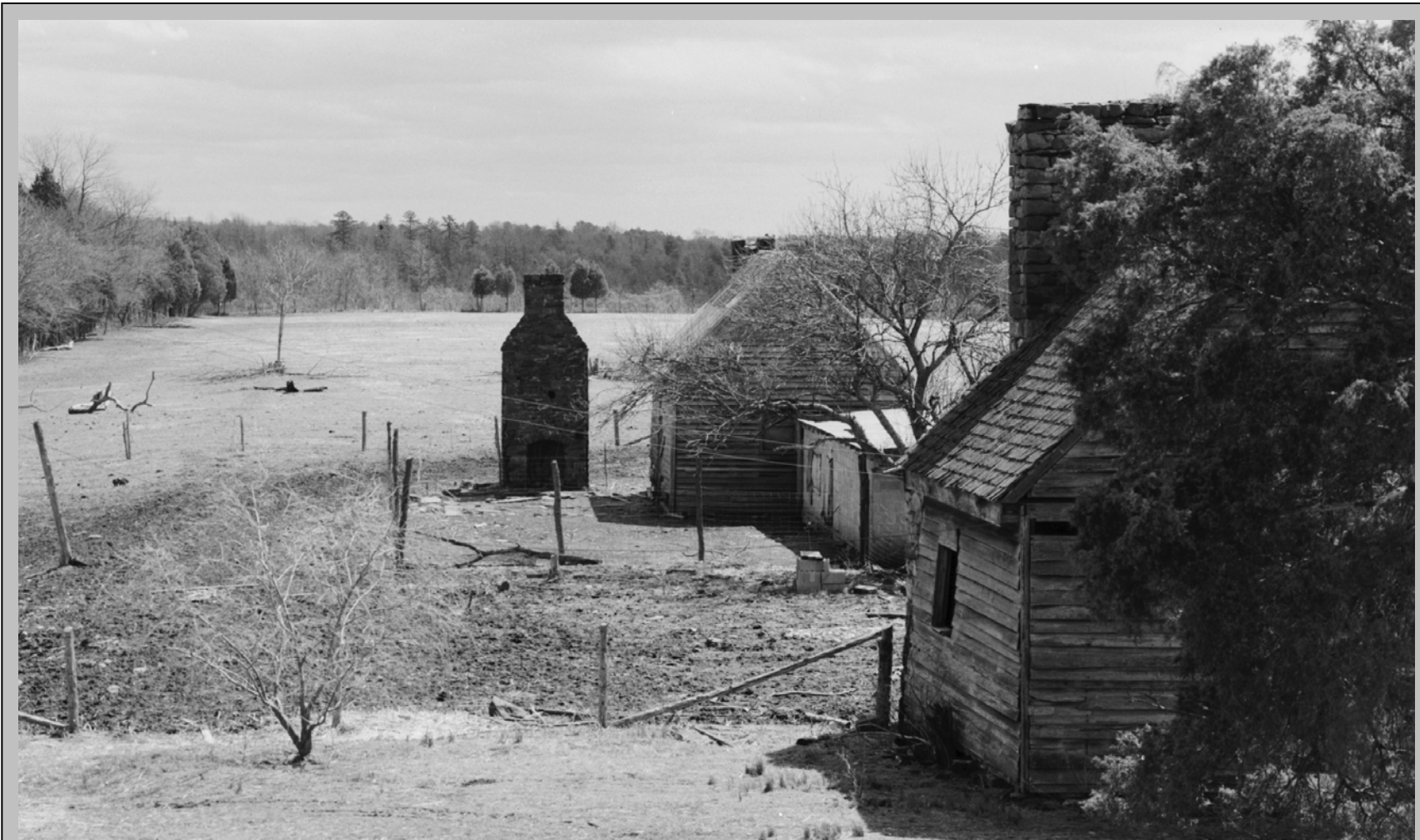
View from Upper Town toward Lower Town and the Staunton River, Green Hill Plantation, Virginia, 1960

Rhys Isaac has suggested that paths and trails into the countryside were the central elements of the slave landscape in Virginia. Some of these secret tracks led to clandestine meeting places in the woods, used sometimes for ritual purposes and at other times for festive parties at which fiddles were played and stolen pigs barbecued. . . A shortcut through the woods or marshlands that surrounded the fields may have allowed slaves from different plantations to rendezvous more conveniently and to return to their assigned tasks with less chances of detection.