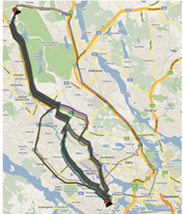
Figure 2: Origin-destination pair with a large number of different shortest paths. 50 shortest paths between 6 AM and midnight for this origin-destination pair are displayed. The paths are drawn with offsets for better visualization.

We obtained historical GPS data traces from Trafik Stockholm [7] for the year of 2008. This data included traces from about 1500 taxis and 400 trucks that plied the streets of Stockholm. In total, there was about 170 million GPS probe points for the whole year. Each taxi produces a GPS probe reading once every 60 seconds that includes taxi identification and location information. Also, for privacy reasons, taxis produce fewer readings