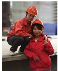
ZPMC crane operators

The temporary work has been manufactured by fabricators in the US and elsewhere. The pipe piles were fabricated by Twin Brothers Marine of Port St. Mary, Louisiana, and the 9200mt of pile were delivered by barges to the site. The temporary towers AE, AW, BE, BW, CE, and CW and the truss superstructure through Tower C were fabricated by American Bridge Manufacturing in its Reedsport, OR, and Coraopolis, PA shops. This work totaled 1,727mt and was delivered to the job by truck. Walkways for ABM's trusses were supplied by GO Supply of Vallejo, California. The D driving frame was fabricated by Jesse Engineering of Tacoma, Washington. This work totaled 941mt and was delivered by barge. Jesse also fabricated the erection tower gantry, which totals 183mt. The transfer girders which attach the D driving frame to the T1 foundation were fabricated by Lortz Manufacturing of Bakersfield, California. These four 98mt weldments were delivered by multi-axle heavy haul trailers. The F and G driving frames were fabricated by XKT Engineering of Vallejo, California. This fabrication totaled 2,130mt and was delivered by barge.