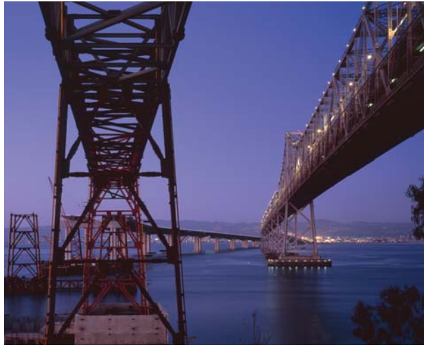
"E" line temporary bridge with original bridge on right

If the temporary works were a stand alone project, it would be a large one. The ABFJV is the design builder for this 'project within a project', which includes the design and construction of twin 607.5m eight-span truss bridges and a 160m erection tower. The temporary bridges will be used to receive, launch, align, and support the permanent twin orthotropic box girder (OBG) superstructure so that the main bridge cable can be anchored in its deck. Once the main and suspender cables are completed, ABFJV will transfer the load of the permanent superstructure from the temporary bridge to the new bridge's cable suspension system. The 160m erection tower will be used as a gantry to lift the permanent steel tower segments weighing up to 1,100mt, then translate them to their final position. All told, these temporary works have a value of about $325 million (including