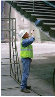
ABFJV's 150 person fabrication management & inspection staff

In order to accelerate the temporary works fabrication, ABFJV also purchased welded box sections from Tung Kang Steel Structures of Taiwan. These sections were assigned to various fabricators for their use. The remainder of the temporary works, including Towers D, F, G, & H, the