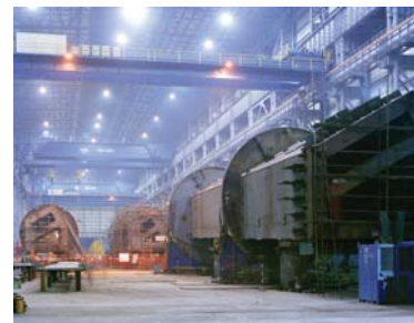
New bridge tower section

The location of some of the box girders over Yerba Buena Island are such that they can not be reached with the Left Coast Lifter . These lifts will be placed on the temporary trusses over the water and slid to the west, up to 200m, to their final locations. A custom built pushing frame, designed by Allnorth Consultants, Ltd. of Vancouver, Canada, will be used to