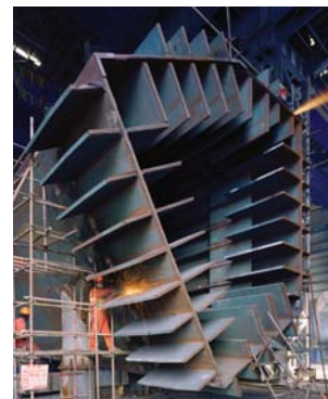
Diaphragm at fuse location

In order to achieve significant material savings (roughly 50%), KCBL used the Permanent Tower as the primary means of lateral load resistance for the T1 Erection Tower against lateral loads induced by lifting operations, wind, and most notably, seismic events. Elastomeric bracing pads were incorporated into the design of each of the 4 main work platforms, which created a direct lateral load path from