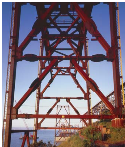
Temporary bridge towers fabricated by AB manufacturing