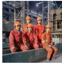
Skilled workers from ZPMC's fabrication shop

when we needed it. In my book, that's a successful job".