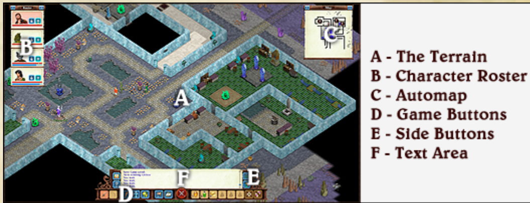
The Avernum 3: Ruined World Screen

When you've started a new game or loaded an old saved game, you will see the Avernum 3: Ruined World screen.