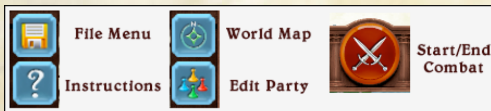
Side and Combat Buttons

You can also select these four buttons by pressing keys F5-F12. To be reminded what each button does, you can move the cursor over them.