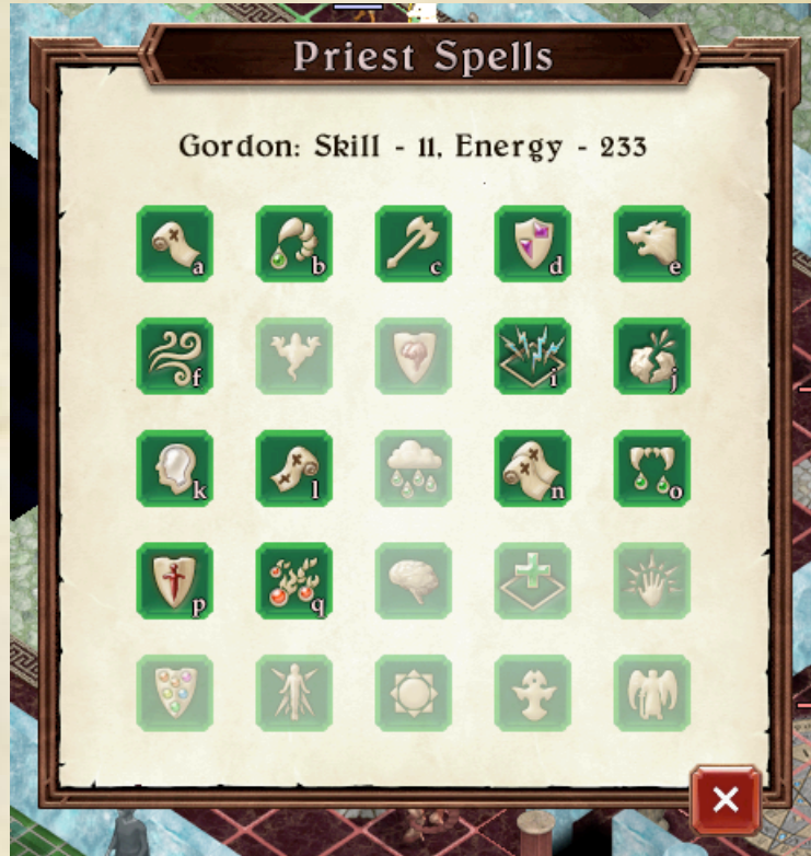
Spell Selection Window

Magic is one of the most powerful tools available to you in Avernum 3: Ruined World. Weapons are great, but nothing produces damage faster or more reliably than a good magic spell. Without magic, you will have a very difficult time succeeding.