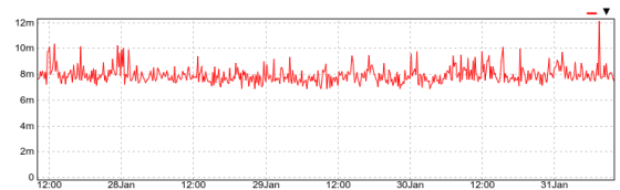
Figure 4: Delay of the Lightning maximum safe timestamp relative to an OLTP database in production at Google.

First, Lightning tries to minimize the impact on the OLTP database where it extracts changes. Because Lightning replicates a large-scale, geo-replicated OLTP database, it has several options for replicating changes. For example, Lightning could replicate changes as soon as they are committed to a single replica. However, this leads to substantial hotspotting on replicas that handle writes, with limited load on other replicas. Instead, Lightning replicates changes only after they have been committed to all replicas. This