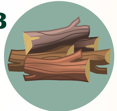
Firewood – larger, dry pieces of wood up to about 10" around.