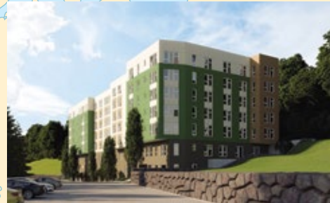
Grata at Totem Lake, Kirkland, WA

A new 160-unit affordable housing community on Beacon Hill at the site of Amazon's former headquarters.