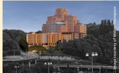
Beacon Pacific Village, Seattle

A new 160-unit affordable housing community on Beacon Hill at the site of Amazon's former headquarters.