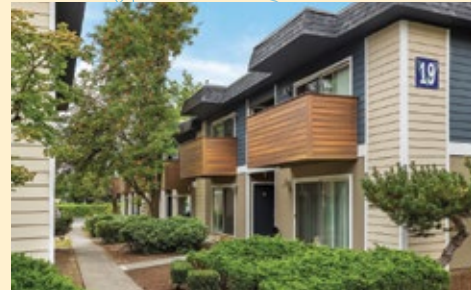
The Renton Sage Apartments, Renton, WA

A new-build apartment complex of 125 affordable housing units in partnership with TWG Development.