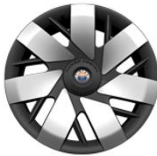
22" F5 AirGlider

Standard on Fisker Ocean One Optional on Extreme, Ultra, Sport