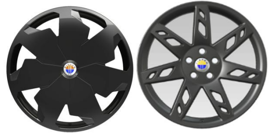
20" F7 Aero Stealth