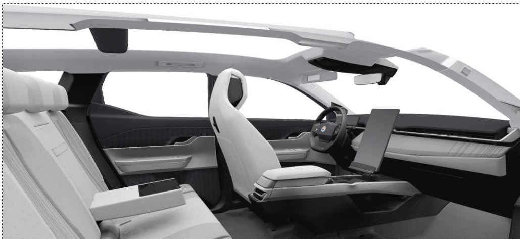
Sea Salt (with bright metallic accent) - optional on Ultra and Extreme