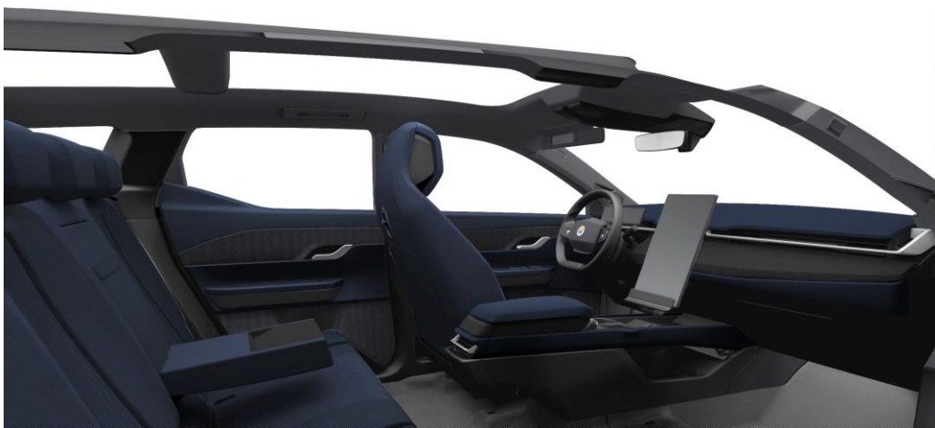
MaliBlu (with bright metallic accent) - optional on Extreme, standard on One