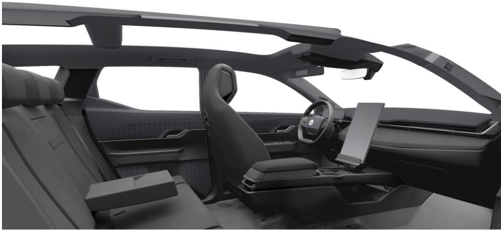
Black Abyss (with dark metallic accent) - standard on all trims