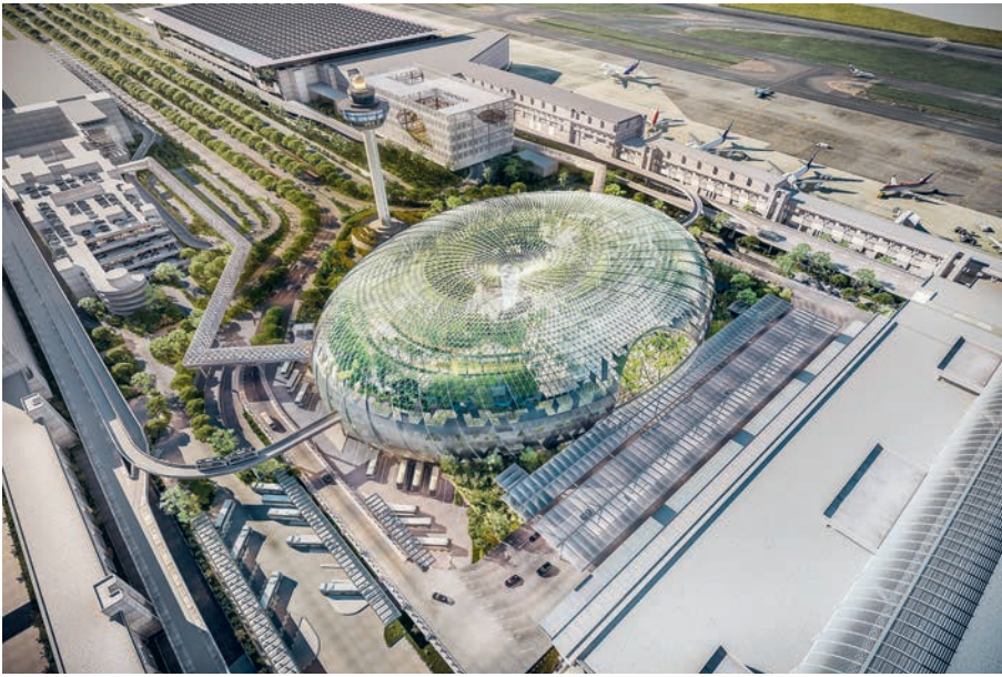
Proposed conditioned glass biodome for Singapore's Changi Airport, Safdie Architects, currently under construction. Courtesy of Safdie Architects.

summer heat. In the 1950s, air conditioning systems entered private households and cars, and started to spread from the US to the entire world. In Singapore, more than 50 percent of all electricity is consumed by cooling systems; in the US, fewer than 5 percent of newly built houses lack a central air conditioning unit. India and China are quickly expanding markets for climate technology, and even in Europe, where A/C is not yet a default element in private houses, there are virtually no office buildings that do not have it. Stan Cox, who wrote an excellent history of the rise of climate technology in the US, estimates its annual energy consumption for air conditioning in the country at 1,650 kilowatt-hours per person, producing half a billion tons of carbon dioxide. 2 Dutch researchers estimate that, while heating energy consumption will decrease, energy demand for air conditioning will rise by 72 percent during this century. 3