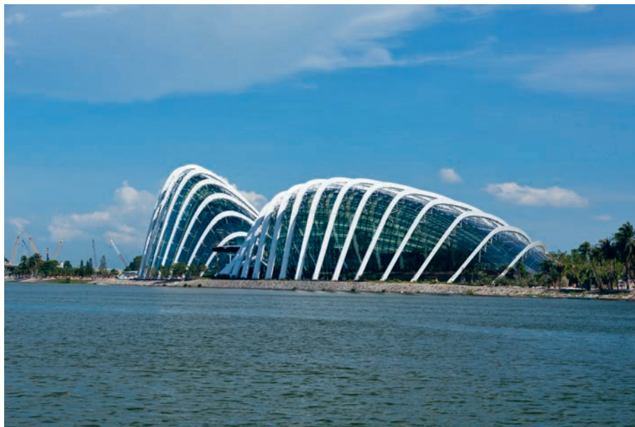
"Cooled Conservatories," Gardens by the Bay, WilkinsonEyre Architects, Singapore, 2006–2012. Courtesy of WilkinsonEyre.

Fourier's dreams, his vision of a homogenized global climate is about to come true. The irony is that we are getting less and less able to tolerate the very same warming temperatures that we are creating, largely through the massive CO 2 output of air conditioning technology itself. As early as 1992, the British economist Gwyn Prins found that "the physical addiction to air-conditioned air is the most pervasive and least noticed epidemic in modern America." 18