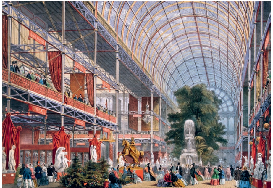
The Crystal Palace built by Joseph Paxton for the Great Exhibition, London, 1851.

It is this cultural significance of climate that inspires the type of artificial atmospheres that societies dream of, and sometimes even build. While our present times seem to fear nothing more than rising temperatures, the nineteenth century, to the contrary, was obsessed with the idea of a slowly cooling planet. Camille Flammarion, Gabriel Tarde, H.G. Wells, and others devised fictional scenarios of human life slowly dying off in an ever colder global climate. Yet, by this period, architects had discovered how to harness the heat of the sun in closed glass-covered spaces even with chilling outside temperatures. Starting in the seventeenth century with the invention of orangeries to protect Mediterranean plants in Northern Europe during the winter months, glasshouse architecture reached its heyday in the second half of the nineteenth century. The famous “Crystal Palace” built in London for the Great Exhibition