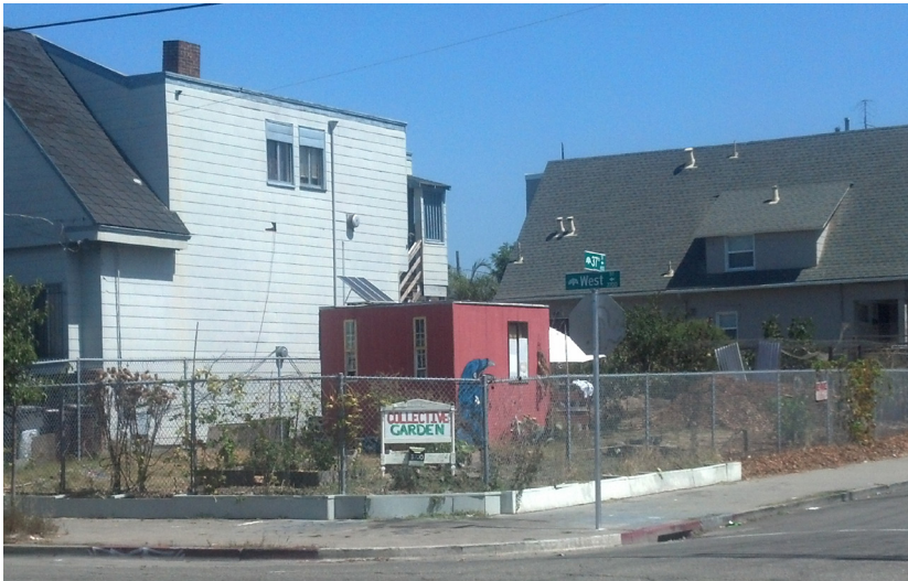
Land Action's proof of concept urban micro-farm near DeCaprio's home, 2015.

or groups of individuals would strong-arm their way into an occupation, what DeCaprio would call “squatting a squat,” ultimately leading to conflicts at numerous squats in Oakland, including the “Hot Mess” Squat, which was rendered uninhabitable due to severe fire damage in the spring of 2014. These dynamics caused Land Action to shift its focus from traditional housing squats to the creation of urban micro-farms in vacant lots around Oakland produced by the city’s anti-blight campaign that demolished run-down tax-defaulted properties.