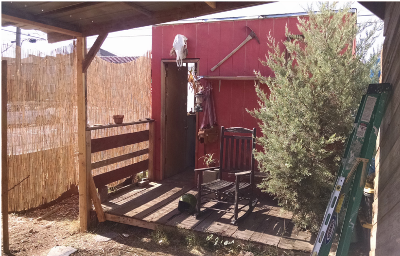
Blighted properties in Oakland reflect the region's uneven development, 2015.

stages, so inexpensive and modular designs that can be easily and cheaply constructed using commonly salvaged or off-the-shelf materials and hand tools are ideal. DeCaprio also espouses the ideals of sweat equity: once a squat has been secured, Land Action initiates a number of home improvements to its squatted properties, including installing drywall and new floors. In one squat in particular where DeCaprio resides, DeCaprio installed solar panels on his roof and remains off-the-grid.