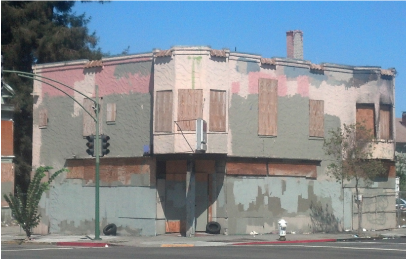
Blighted properties in Oakland reflect the region's uneven development, 2015.