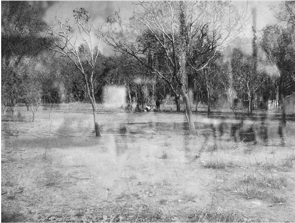
Film stills from Wutharr: Saltwater Dreams by the Karrabing Film Collective, 2016.