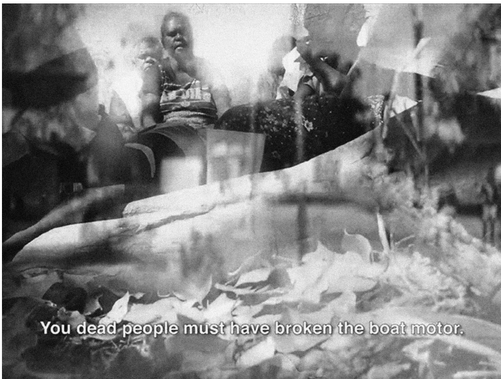
Film stills from Wutharr: Saltwater Dreams by the Karrabing Film Collective, 2016.