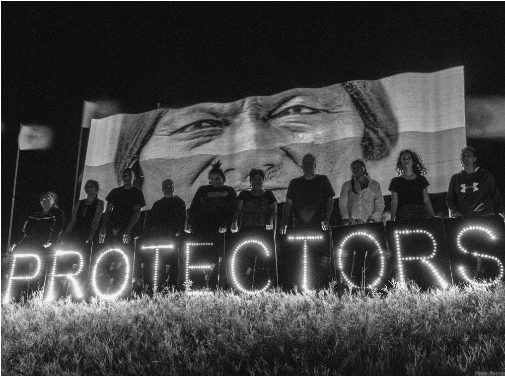
Sitting Bull with protectors in Canon Ball, ND.