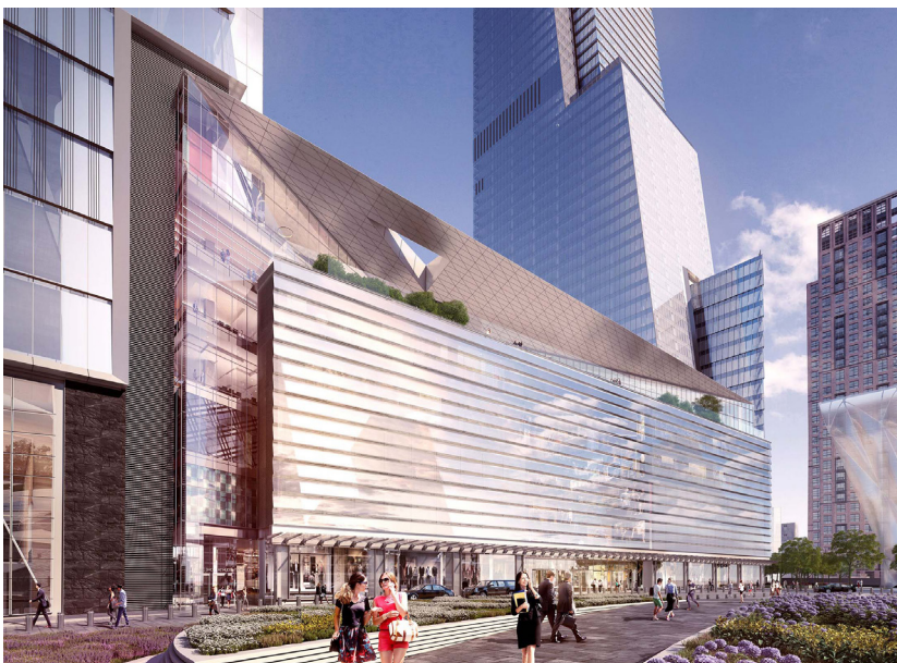
The shops and restaurants, view looking east from the plaza.