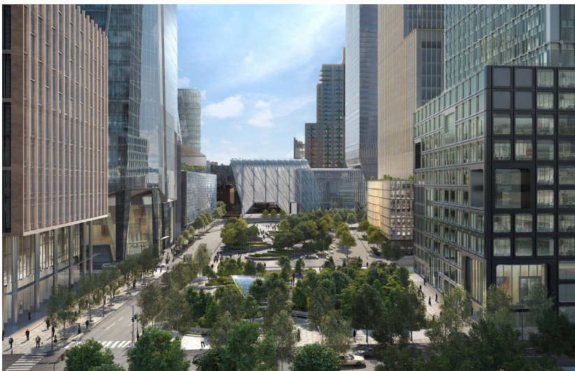
Hudson Yards Real Estate Development.