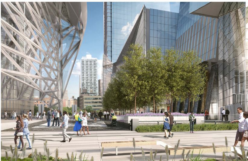
The shops and restaurants, view looking east from the plaza.