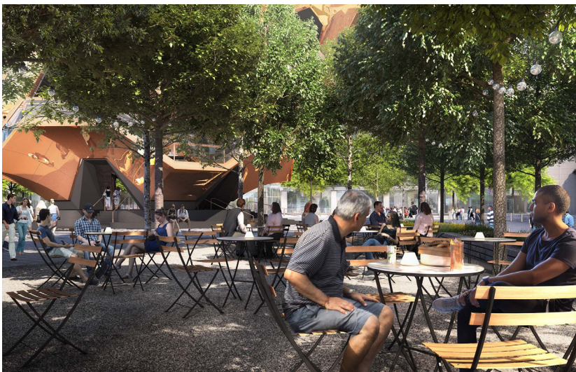
View of the Pavilion Grove.

[4] David Wachsmuth, "City as Ideology: Reconciling the Explosion of the City Form with the Tenacity of the City Concept," Environment and Planning D: Society and Space , vol. 32, no. 1 (February 2014): 86.