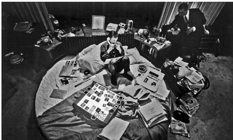
Hugh Hefner at the helm of his media empire: the bed.