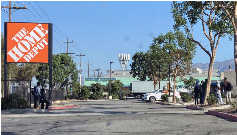
Casual construction laborers seeking work, Home Depot, Glendale, California.