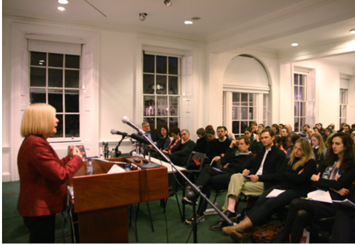
Chantal Mouffe delivers her response to presenters and the audience.

turn within which there remained a broad spectrum from critical to opportunistic. In gathering this group of leading theorists on the conjunction of architecture and politics, the Architecture Exchange event produced not only an assessment of Mouffe's relevance but also, and perhaps inadvertently, an assessment of the commonalities and limitations along this spectrum.