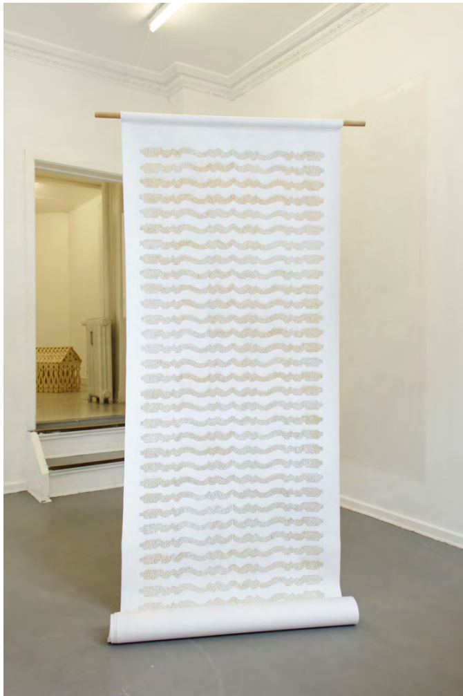
La Vaughn Belle, Cuts and Burns , 2016–present; drawing/installation at meter, Copenhagen; courtesy of the artist.

From a distance, the long scroll reads like an official ledger, contract, or declaration, with each hole recording an absent presence in the archive. Up close, populated with scorched clusters of orderly violence, the holes mimic the tomblike blueprint of the slave ship—one of the most widely deployed abolitionist images circulated among Whites to give form to the unimaginable conditions endured by enslaved captives. While powerful, such representations also teeter uncomfortably at the edge of violence as spectacle. Perhaps responding to the dehumanizing dangers of this kind of display, the replacement of drawn bodies with etched burn marks sets fire to the archive of slavery. Bereft of the voices of the enslaved, the burn marks reconstitute the archive as a corpus of present absences. Placing these surfaces under the microscope and enlarging their gestures, patterns, and narrative capacities, Belle's incendiary architectures reimagine the edifices, instruments, and testimonies of Black survival and protest. The multiply coded fretwork necessitates the close reading of the built world—passages in both space and historical narrative.