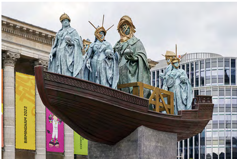
Hew Locke, Foreign Exchange , 2022; resin, fibreglass, and steel frame around pre-existing bronze statue; 728 x 435 x 682 cm; photograph by Stuart Whipps, courtesy of the photographer.

From one perspective, Foreign Exchange exhibits perfect compliance with this conservative policy. The state-sanctioned and, importantly, temporary integration of Locke’s anti-colonial framework with this fixture of the imperial imagination successfully retains and explains the dimensional, embattled space of public memory. At the same time, Locke’s sculptural addition preserves the gap between existing and new forms. The smooth, finished surfaces of the Victorias and the boat appear in stark contrast to the raw wooden scaffolding that still visibly protects the original statue from its new surroundings. Rather than concealing the practical conditions of the work’s contract with such heritage mandates, Locke draws viewers’ attention to it. He preserves not only the statue but also the sense of fragility and indeterminacy of a history still under construction. Arrested between blueprint and edifice, Locke’s Foreign Exchange remembers empire’s legacy of crimes and commemorates a future still unfolding. Working with the existing statue’s form, Locke’s temporary renovation remains both complicit and unresolved. An open-ended proposal, its composite form stands as a continuous invitation to construct alternative, additive, and parallel spaces inside the built worlds we have already inherited.