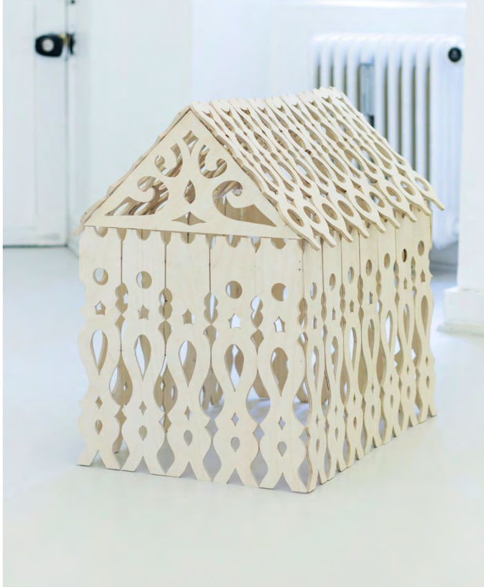
La Vaughn Belle, Constructed Manumission , 2017; handmade wooden houses; installation at meter, Copenhagen; courtesy of the artist.

they are held together with small metal pins and their own weight, representing autonomy and fragility at once. Their capacity to endure rests on a continuous cycle of disassembly and restoration. They are also constructed entirely from the fretwork designs ordinarily featured as architectural ornament (e.g., roof gables); here, the embellishments form the structure itself, “standing alone” as substantive and self-sufficient manifestations of imagination, planning, and technique. At the same time, the negative space between the ornate planks evokes the houses’ uninhabitability; their shelter is provisional, bordering on precarious.