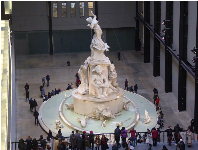
Kara Walker, Fons Americanus , 2019; Tate Modern, London; courtesy of Ardfern via Wikimedia Commons.

This hostile architecture is echoed in the fountain’s shark-infested waters that encircle the fountain’s central pictorial narratives, crowned by a wounded nursing figure—the “Daughter of the Waters”—with her head thrown back as she bleeds from a gash in her throat and lactates. These bodily fluids of stolen life both display and erase the carceral embodiment of the enslaved woman, converting the memory of blood and milk into water and illustrating how monuments of empire participate in the material, economic, and narrative washing away of its proximities to colonial brutality. Recalling simultaneously the chemical metamorphoses of sugar refinement, the transformation of plantation profits into cultural institutions, and the powerful role these institutions play in the continued management of their historical intimacies with slavery, the fountain betrays its own self-sustaining ritual of contamination and purification.