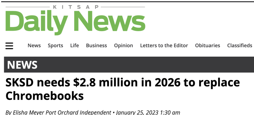
Figure 2. Headline from Kitsap Daily News

Now, some three years after that huge spike in Chromebook sales – over 31 million units sold in that first year of the pandemic 12 – schools are beginning to see their Chromebook fleets fail. This is the dark side to Chromebooks: they don’t last as long as they should, and have unique challenges to fixing them.