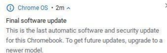
Figure 5. Message that appears on Chromebooks when they reach their AUE date.

Chromebooks are a different story. These devices come with a built-in expiration date from the beginning, limiting the useful life of a Chromebook.