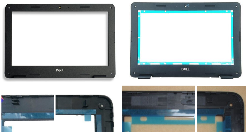
Figure 7. Can you spot the difference? From left to right, on top the front and on the bottom the back of the Dell 11 3100 Non-touch Chromebook Bezel and Dell 11 3110 Non-Touch Chromebook Bezel. These parts are not compatible across models, the only external changes between them being the addition of small notches on the bottom of the newer model. On the bottom row from left to right, on the back of the bezels we can see that 3110 has missing or less pronounced clips which renders them incompatible.

Peter Mui, founder of Fixit Clinic, explained to us how models slightly change batteries and arbitrarily change plastic bezels on the screen, which foil repair. To test this, we reviewed the six manufacturers on edu-parts.com, a popular parts reseller, to assess if the plastic bezel that surrounds the laptop’s screen were compatible from one sequentially released model to the next. All six of the manufacturers we surveyed made non-functional changes to the bezels of their Chromebook 11 sequentially released models that made these parts incompatible from one model to the next. For example, from the Samsung Chromebook 11 XE500C12 to XE500C13 the cutout in the bezel for the camera changed from a square to a circle. This cosmetic change rendered replacement parts incompatible across models. From the Dell 11 3100 to the Dell 11 3110 the bezel is not compatible across models, the only visible changes to the user between them being the addition of small notches on the bottom of the newer model. On the back of the bezels the 3110 version has missing or less pronounced clips which renders them incompatible.