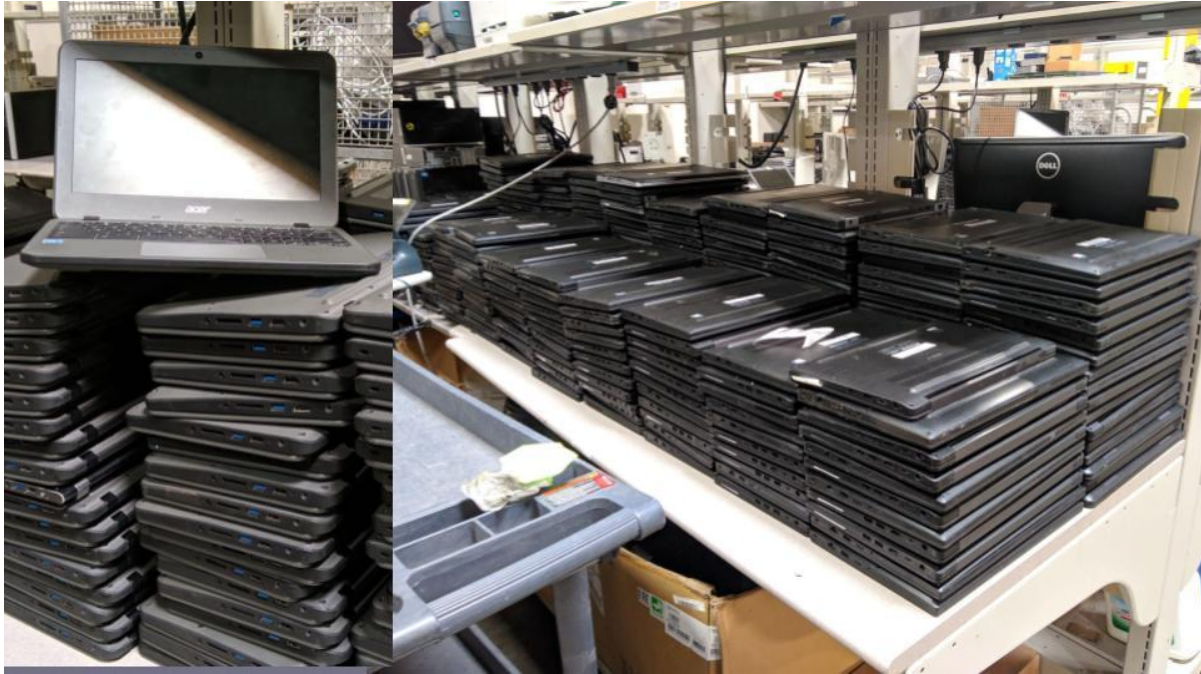
Figure 1. A school system's Chromebooks that are no longer usable.