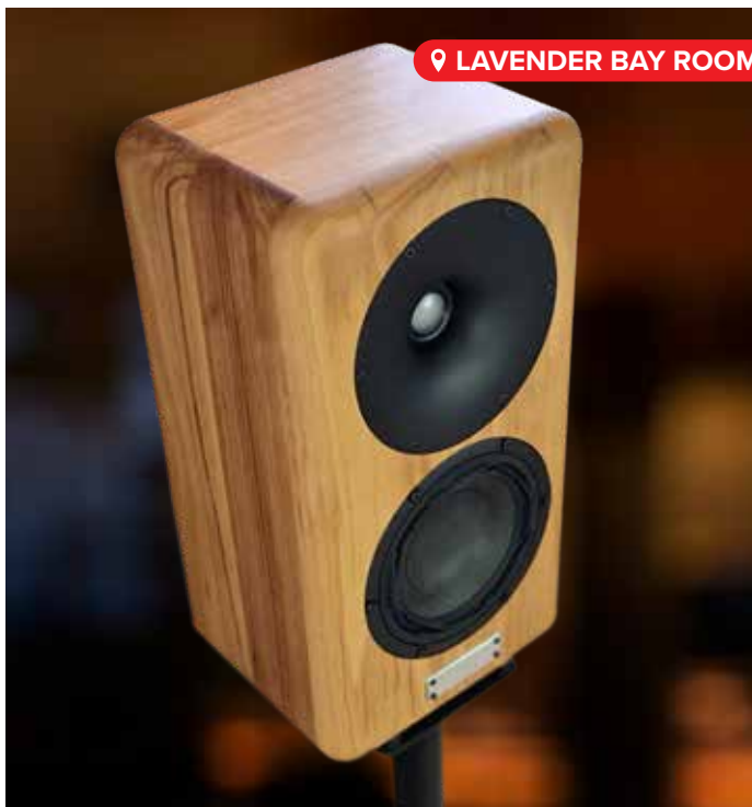
📍 LAVENDER BAY ROOM