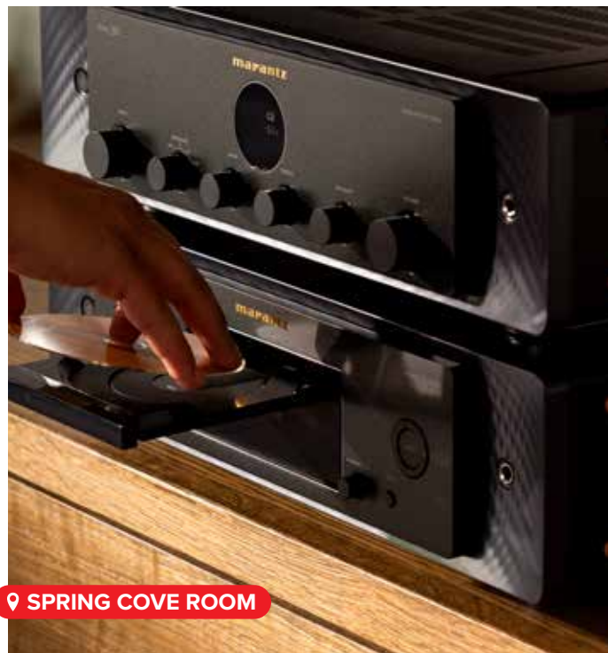
📍 SPRING COVE ROOM