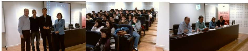
Figure 1: University Mobility Management conference organised in October 2010

UPV/EHU first proposal has been discussed in a University Mobility Management conference organised in October 2010 with the objective to exchange experiences with other Spanish Universities, with the collaboration of the Mobility Board of CRUE-CADEP (Spanish University Dean Group).