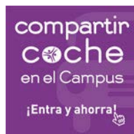
Figure 3: Car-pooling programe web banner