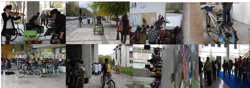
Figure 4: Awareness campaign