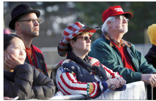
Supporters of US President-elect Donald Trump attend a pre-inaugural concert at the Lincoln Memorial in Washington on Thursday.