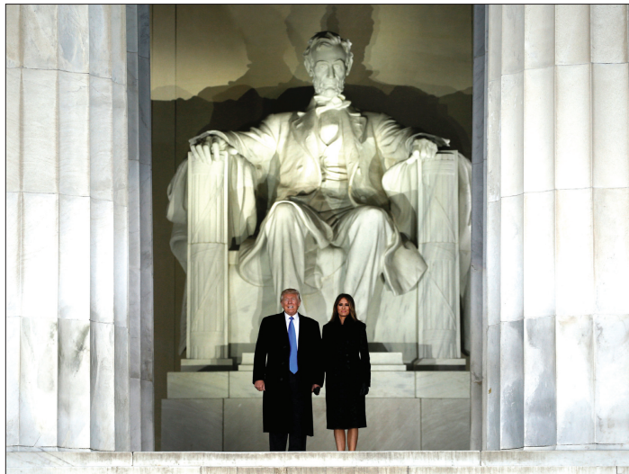
US President-elect Donald Trump and his wife Melania take part in a Make America Great Again welcome concert in Washington on Thursday.

The Taiwan issue is widely known in the world as a core interest and red line for China.