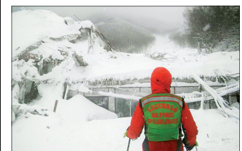
A member of Lazio's Alpine and Speleological Rescue Team stands in front of the Hotel Rigogliano in Farnidola, central Italy, hit by an avalanche. Hopes of finding survivors dwindled on Thursday as rescue workers searched for more than 24 hours after the avalanche struck the luxury mountain hotel, burying up to 30 people under tons of snow and debris.