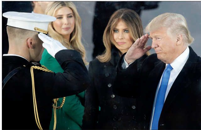
US President-elect Donald Trump salutes a soldier next to his wife Melania (center) and daughter Ivanka as they arrive at the pre-inaugural concert at the Lincoln Memorial in Washington on Thursday.