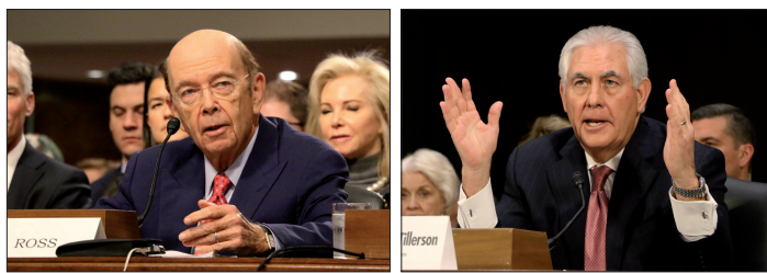
Wilbur Ross, secretary of commerce nominee, testified at his confirmation hearing before the Senate Commerce, Science and Transportation Committee.