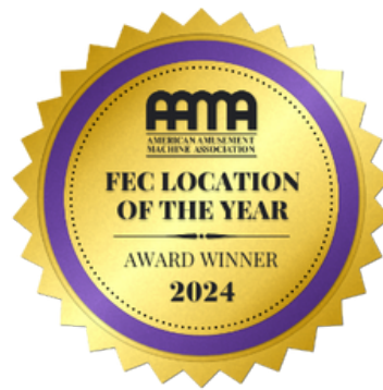
Elev8 Adventure Park