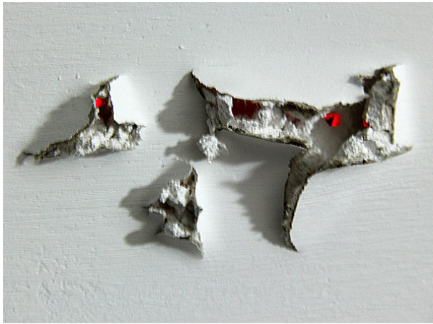
Figure 3: Inscripted adapted graffiti glyphs.

ment machine learning to produce an adaptive, autonomous and self-directed agency.