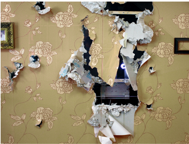
Figure 1: Zwischenräume : curious robots transform our familiar environment.

The installation Zwischenräume embeds autonomous robots into the architectural fabric of a gallery. The machine agents are encapsulated in the wall, sandwiched between the existing wall and a temporary wall that resembles it. At the beginning of an exhibition, the gallery space appears empty, presenting an apparently untouched familiar space. From the start, however, the robots' movements and persistent knockings suggest comprehensive machinery at work inside the wall. Over the course of the exhibition, the wall increasingly breaks open, and configurations of cracks and hole patterns mark the robots' ongoing sculpting activity (Figure 1).