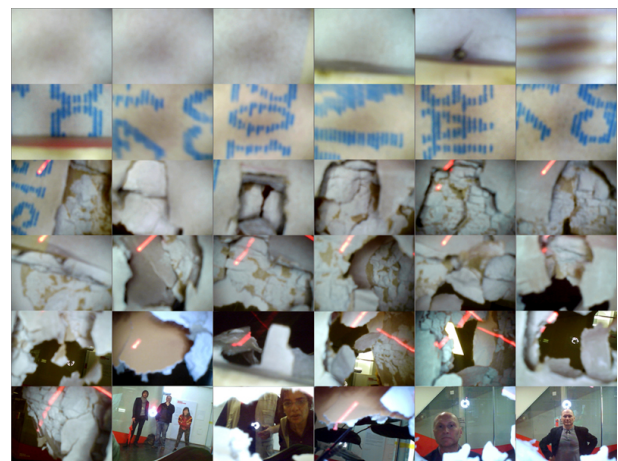
Figure 4: Robot captures, showing the evolution of interesting changes in the environment.

Consequently, intrinsic motivation to learn directs both the robot's gaze and its actions, resulting in a feedback process that increases the complexity of the environment – through the robot's knocking – relative to the perceptual abilities of the agent. Sequences of knocking actions are developed, such that the robots develop a repertoire of actions that produce significant perceived changes in terms of colour, shapes and motion. In this way, the robots explore their creative potential in re-sculpting their environment. Figure 4 presents a collage of images taken by a single robot when it discovered something 'interesting', illustrating how the evaluation of 'interesting' evolved for this robot; it shows how the agent's interest is affected by: (a) positioning of the camera, e.g., the discovery of lettering on the plasterboard wall; (b) use of the hammer, e.g., the production of dents and holes; and, (c) interaction of visitors.