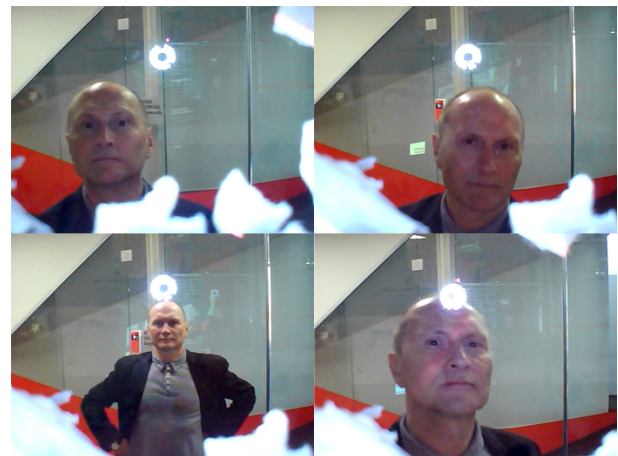
Figure 5: Gallery visitor captured by one of the robots' cameras as he performs for the robotic wall.

By turning around the traditional relationship between audiences and machinic performers, the use of curious robotic performers permits a re-examination of the machine spectacle. Lazardig (2008) argues that spectacle, as "a performance aimed at an audience," was central to the conception of the machine in the 17th century as a means of projecting a perception of utility; allowing the machine to become "an object of admiration and therefore guaranteed to 'function'". Kinetic sculptures and robotic artworks exploit and promote the power of the spectacle in their relationship with the audience. This is also the case in Zwischenräume however, it is not only the machines that are the spectacle for the audience but also the audience that becomes an 'object of curiosity' for the machines (Figure 5). Thus the relationship with a curious robot extends the notion of the spectacle, and, in a way, brings it full circle.