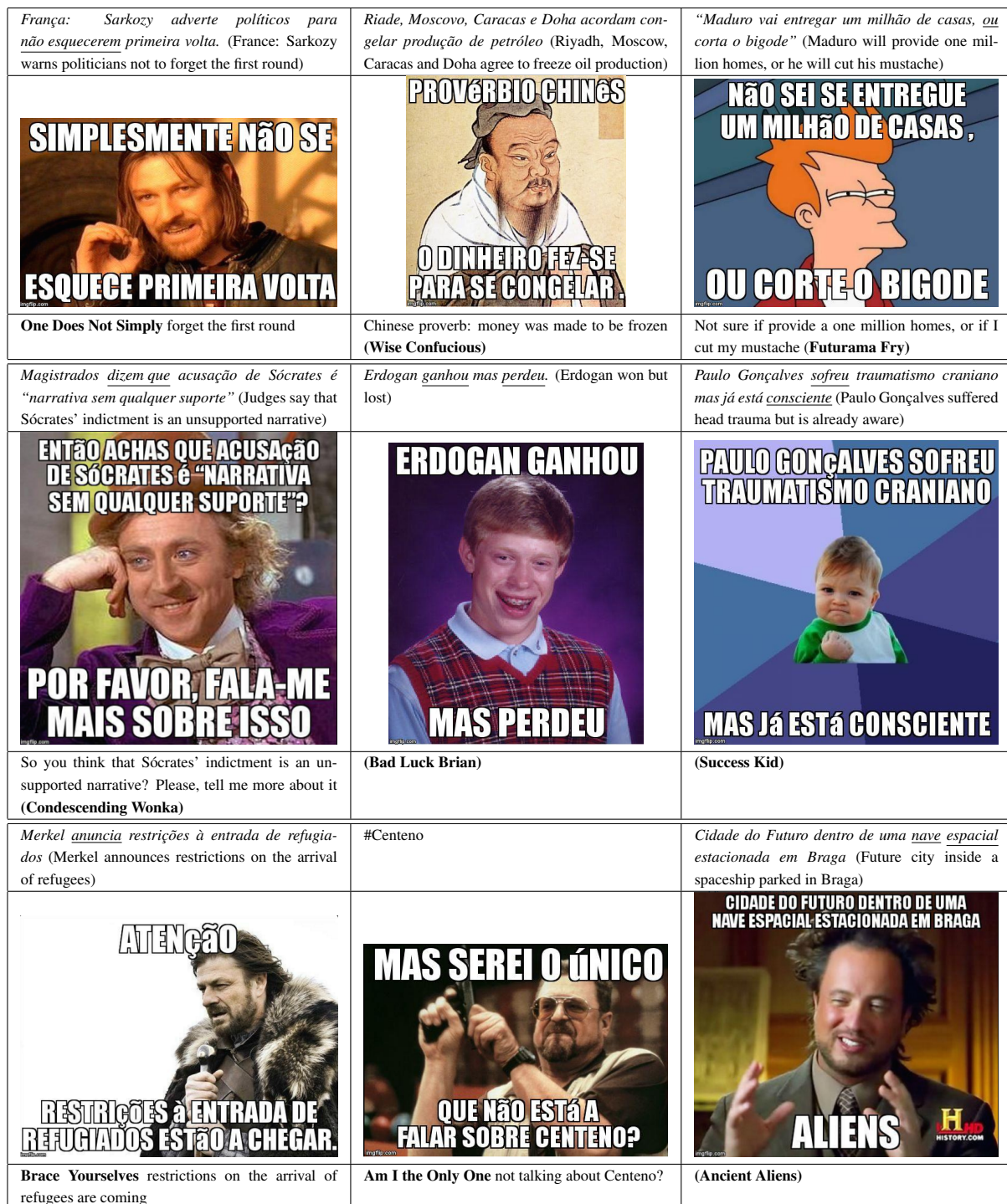
Figure 2: Examples of produced and published memes of different types.