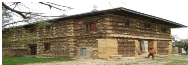
Debere Damo monastery (Tigray-Adwa)

In examining the architecture structural form of church construction in the history of EOTC, it's possible to identify three main type developments. The earliest common typology, which has been determined for the earlier churches, was the basilica style. It is believed that this style was reflective of the influence of the early Middle East Orthodox churches particularly Egypt and Syrian since 6 th century A.D, (Salvo 1999:59).