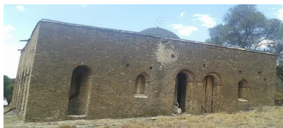
St Mary church at Wäybla Bäläsa north Gondar district (Photo by author, 5/3/2016)

Rectangular church buildings are in corporation of different styles from both the Axumite and the Byzantine world techniques. Some of the rectangular structures on the other hand, have forms of the Hebrew sanctuary. They are supposed to have been adopted from the O.T to remind the synagogue. Therefore, the old traditions of such architectural styles are said to have taken from the near eastern temple architectures, (KirsMagazine 5 th , June 2004).