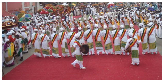
Priest dancing in Feast day Gondar 2008

The EOTC has a colorful church hymn, which is especially striking during major religious holy days. Most of foreign tourist is attracted by the ceremony, Church hymn (Zema) is still a major subject of the traditional church education in Ethiopia. A major aspect of the Ethiopian church hymn is the rhythmic religious movement (dance) that always accompanies the liturgical chant some writers have suggested that the liturgical dance, cestrum and prayer- sticks ( Meqamyä ) of the EOTC may have originated in ancient Egypt. However, in its contemporary manifestation a religious musical performance of the Ethiopian clergies reflects yet another and amore recent layer of cultural interactions with the world of the OT (2 Sam 6:2-5), (Taddese 1985: 141).