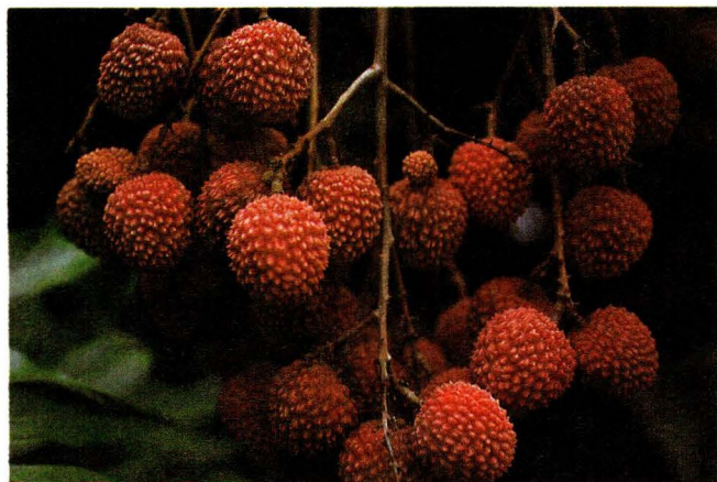
Figure 1. 'Groff' lychee.

Amounts of fertilizer applied to bearing trees vary depending on tree condition and location. With many fruit trees, a general rule is to apply annually 1 lb (454 g) of fertilizer for each inch of trunk diameter measured at a height 4-5 ft (1.2-1.5 m) from the ground. This rule may be difficult to use with lychee cultivars that have low branches. An alternative method is to apply 3/4 lb (340 g)