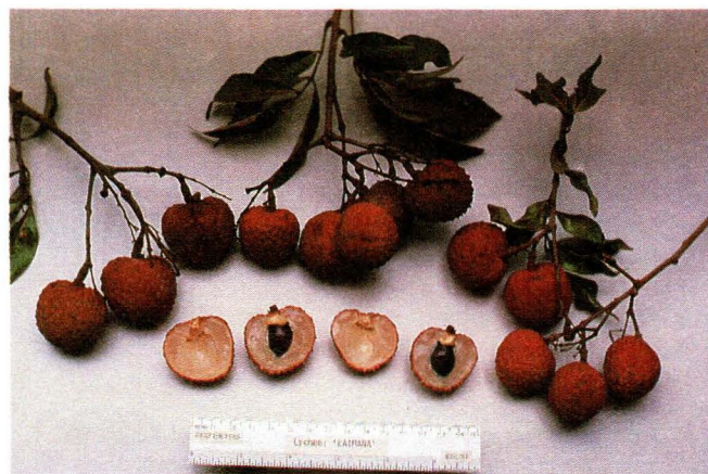
Figure 2. 'Kaimana' lychee.