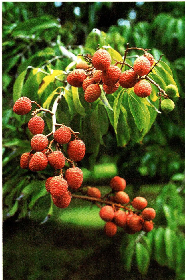
Figure 3. 'Kwai Mi' lychee.