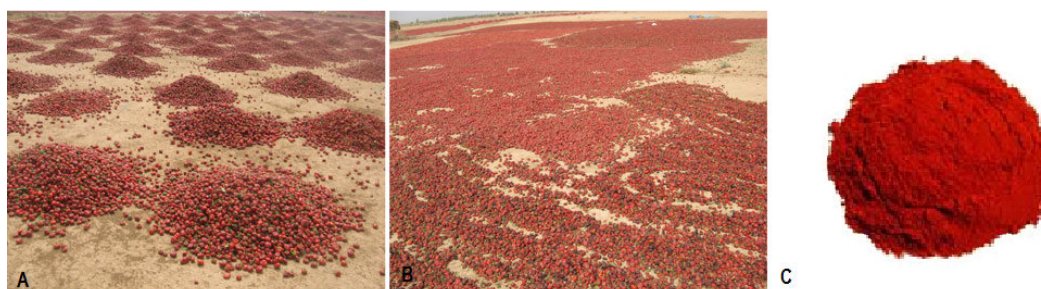
Figure 2: A (to the left): the fruits of pepper cultivars ( Capsicum annuum L.) are initially stacked in piles for the post-maturation without exposure to direct sunlight. B (to middle): the fruit is dispersed in the previously clean and compacted soil for a homogeneous drying in the Sun. C (to right): the paprika powder