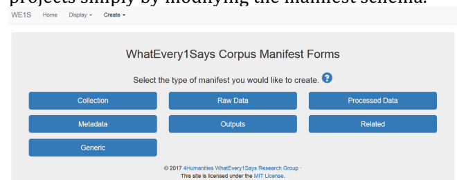
Fig. 1: Web interface for WE1S manifest system.

used in project work. Manifests make the workflow transparent and facilitate on-the-fly reiterations or adjustments--e.g., staging a subset of the WE1S corpus for topic modeling or defining variant numbers of topics. Manifests are human-readable JSON files that are highly interoperable with other systems; they can be used programmatically to drive scripts or to crosswalk information to other workflow tools or metadata frameworks. The WE1S workflow management system uses the manifest schema to generate web forms, enabling non-technical users to create and query manifests, which are stored using the same JSON-like format in its MongoDB database. The system is easy to deploy and can be adapted for other humanities research projects simply by modifying the manifest schema.