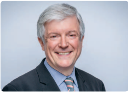
Tony Hall, Lord Hall of Birkenhead, CBE Director-General since April 2013.