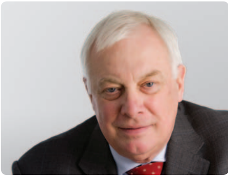
Lord Patten of Barnes CH, Chairman (stepped down on 6 May 2014)

Trustees are part time and come from a variety of backgrounds, bringing a wide range of experience to the BBC.