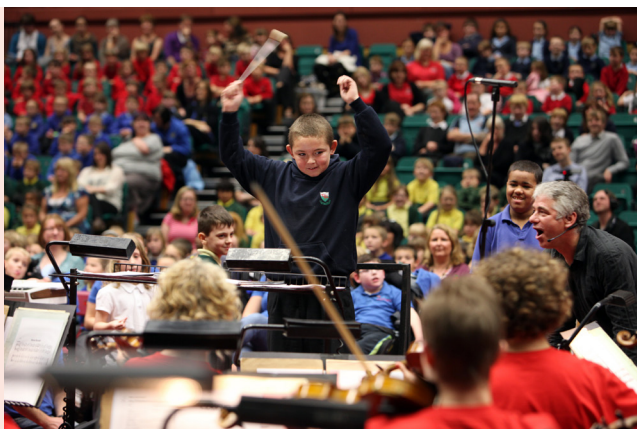
BBC National Orchestra of Wales special schools concert

Within the BBC, collaborations have ranged from a portfolio of soundtracks – including Doctor Who , Great Barrier Reef , Human Planet and The Story of Wales – and a special series of afternoon concerts for BBC Four's series Symphony in November 2011, to a unique BBC Radio Wales Orchestra Day on 27 January 2012, when the station broadcast its daytime shows from Hoddinott Hall with frequent and lively contributions from the Orchestra!