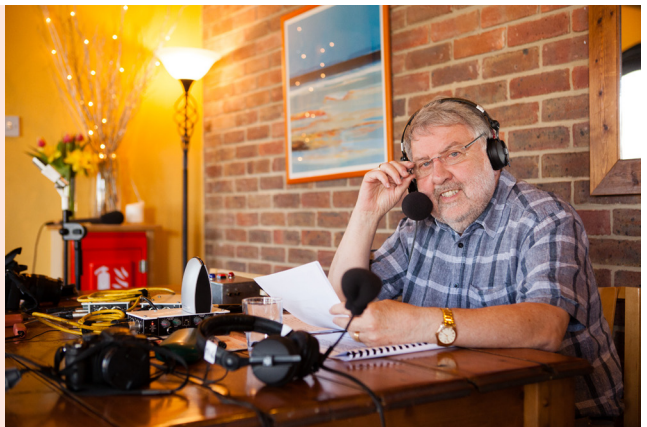
Roy Noble broadcasting during BBC Radio Wales Music Day

Around 200 hours of features were broadcast on the station in 2011/12. Highlights included the double award-winning The Mousetrap and Me , which told the story of the Newport man whose tragic story of foster care inspired Agatha Christie to write the classic West End play.