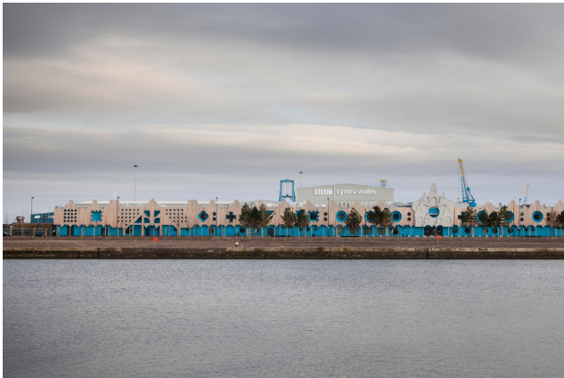
The new Roath Lock studios

In the interactive space, the BBC is currently developing 'nations' editions' of bbc.co.uk which will help audiences find content about Wales more easily across computers, mobiles and tablet devices. The editions will provide a more effective way of publishing relevant content within a UK-wide interactive portfolio of services.