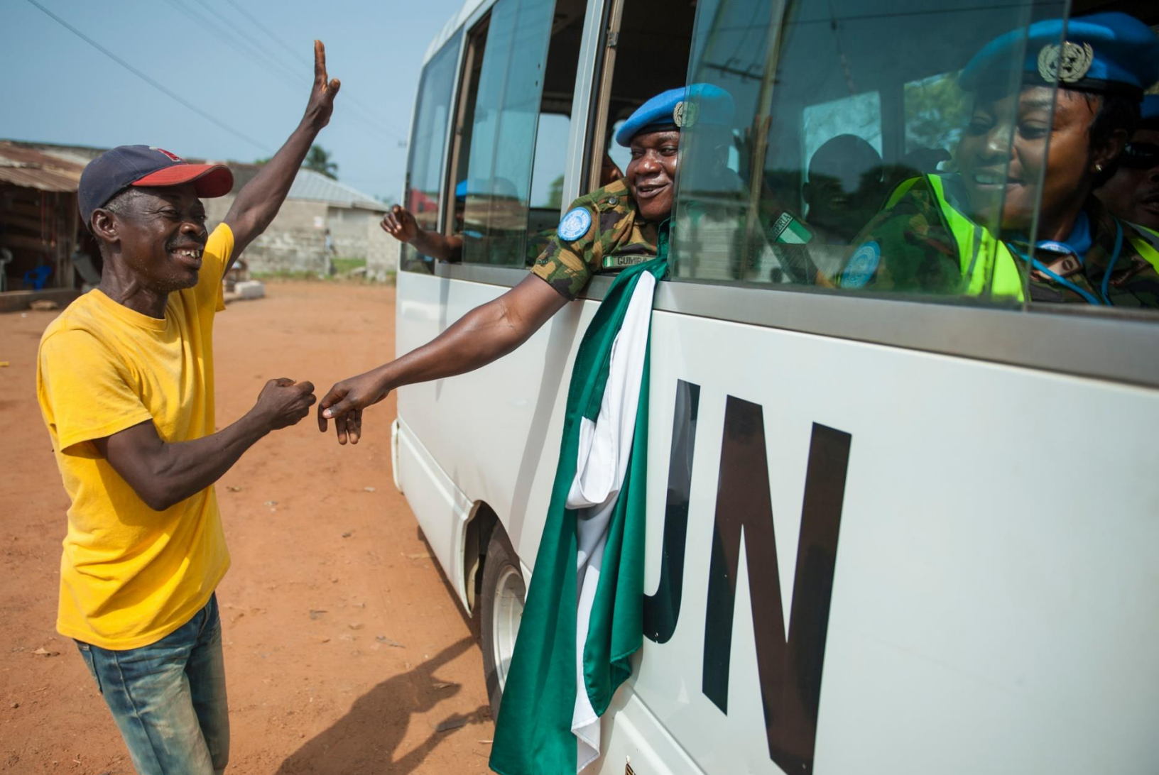
Nigerian peacekeepers serving with the UN Mission in Liberia (UNMIL) departing for Roberts International Airport at the end of their deployment. Two hundred Nigerian peacekeepers, the last military protection force in UNMIL, left Liberia in February 2018 as part of the termination of the Mission's mandate.