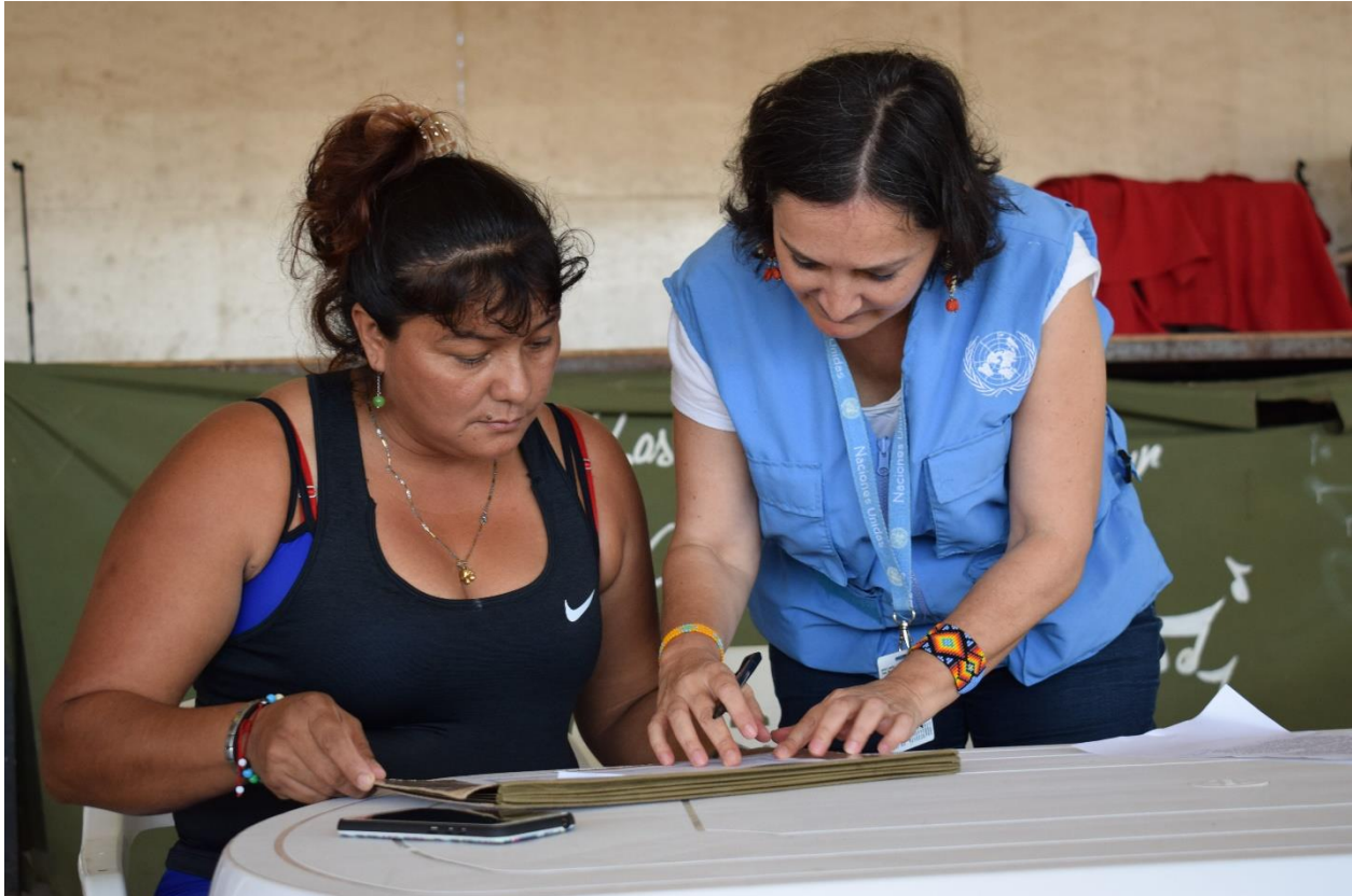
ASOMIC Association signs agreement for the fishing project in Former Reintegration Area La Pradera. Puerto Asís, Putumayo, Colombia.