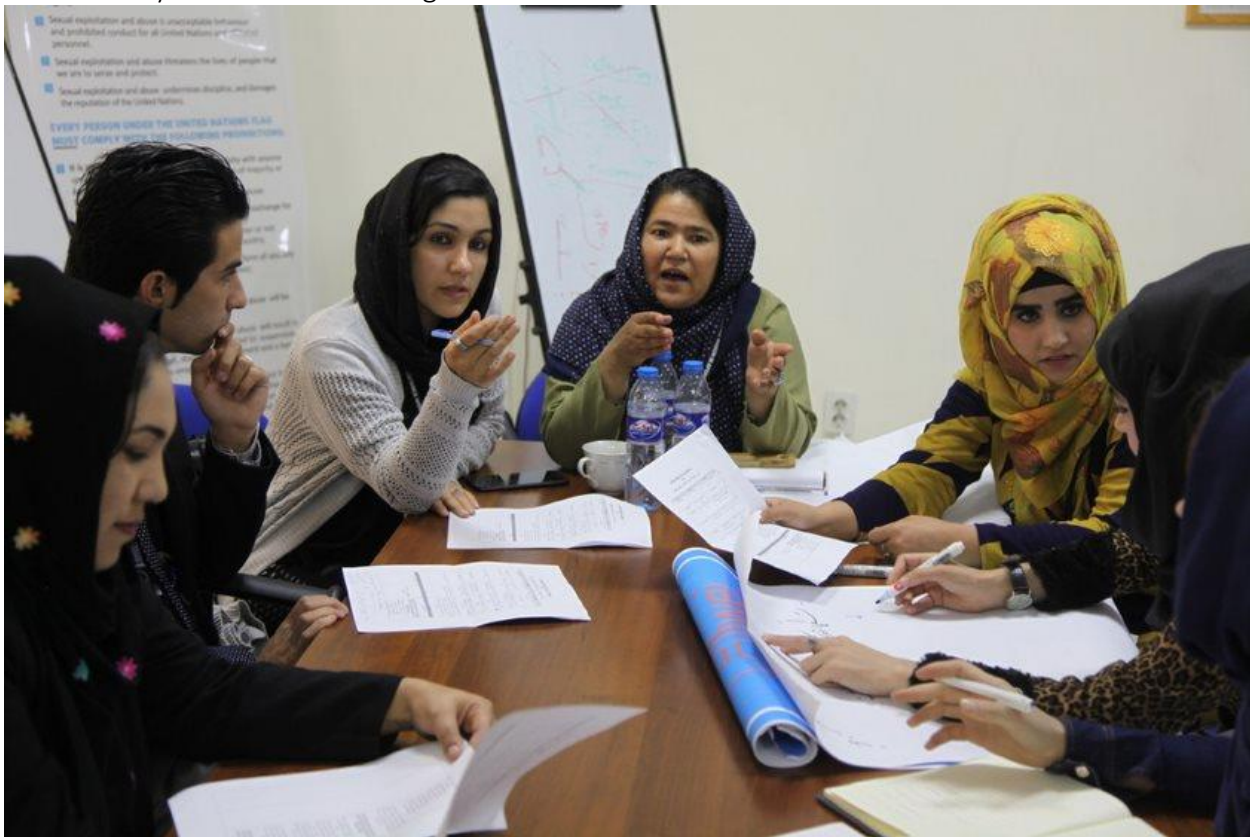
UN-backed forum on women's inclusion and participation in peace discussions in Mazar-e-Sharif, Afghanistan.

conceptual clarity to foster a common understanding of local mediation processes across the UN seems essential. There is also a need to develop a set of considerations or criteria that can help UN actors better assess the nature, risks and political significance of local mediation processes, as well as the prospects of pursuing linkages with high-level mediation efforts as part of broader peace process design deliberations.