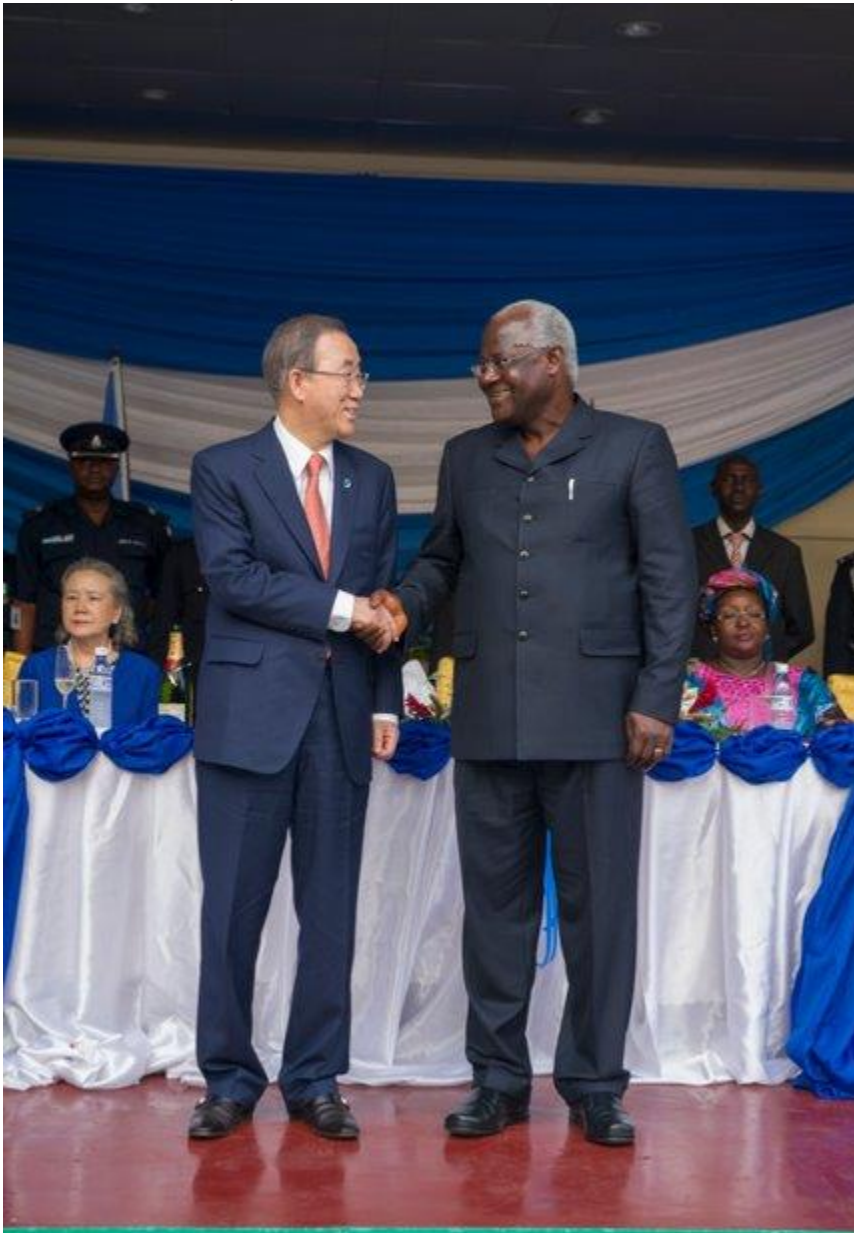
Then-Secretary-General Ban Ki-moon (left) with Ernest Bai Koroma, President of the Republic of Sierra Leone, during the ceremony marking the closure of the UN Integrated Peace Building Mission in Sierra Leone (UNIPSIL) and the transfer of its responsibilities to the UN country team. March 2014.

10. The project is more than the sum of the outputs; good working relationships among the project partners have been created as well as with partners outside the UN.