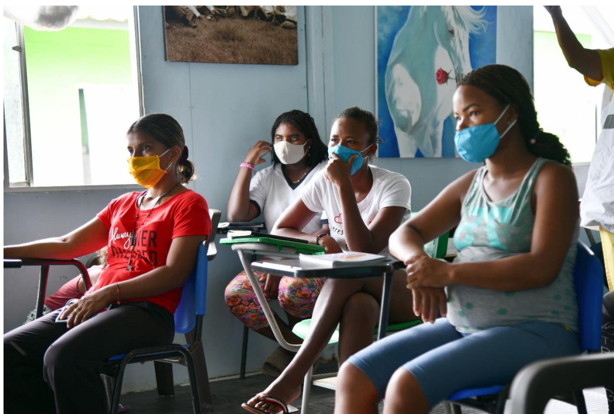
Women former combatants in the process of reintegration from the community of the former Territorial Area for Training and Reintegration (TATR) La Variante in Tumaco, Nariño, beginning a training programme in public health and community epidemiological monitoring, October 2020.

The Colombian peace process and Final Peace Agreement were ground-breaking in incorporating women's participation in peace talks and strong women's rights and gender provisions. The experience of two successive UN Special Political Missions in supporting Colombia's parties and society in the verification and implementation of the Agreement has similarly broken new ground and provides lessons for the UN and broader international community on how to support a gender-inclusive design and implementation of peace agreements. The breadth and depth of the experience in Colombia offers valuable lessons for other contexts in advancing the WPS agenda. These include, for instance, early deployment of dedicated gender expertise to set a foundation for inclusion of the WPS agenda in the work of the mission; the need for committed and accountable mission leadership and internal policies to mainstream gender across all areas of work; established and continuous consultations with women's civil society, both at senior level as well as through grassroots relationships with field offices; strategic partnerships between the mission, UNCT, the Government, Member States and civil society to support the holistic implementation of the WPS agenda; as well as the mobilization of dedicated resources and funds to support inclusive peace agreement implementation.