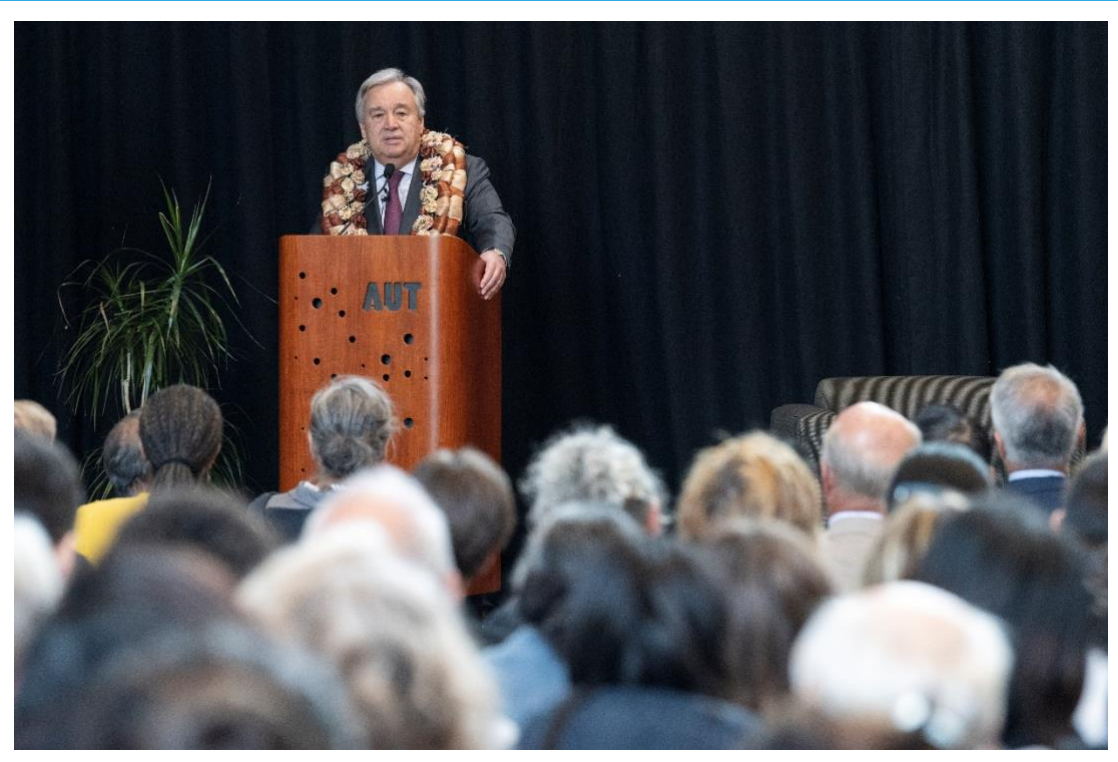
Secretary-General António Guterres makes remarks to students at the Auckland University of Technology, about the need to defeat climate change and ensure that technology is used as a force for good.

The active engagement with partners enabled DPPA to contribute a climate security perspective to several reports of the Secretary-General during the reporting period, including on West Africa and the Sahel; the global state of peace and security; and the protection of civilians. MYA funds were also used to advance targeted research and strengthen the knowledge based on climate-related security risks. To this end, DPPA commissioned a multidimensional study of climate risks in the Middle East and North Africa that analyzed the interactions between climate change and social, political, economic and demographic factors, and provided recommendations to strengthen the ability of the UN to prevent conflict and sustain peace in the region.