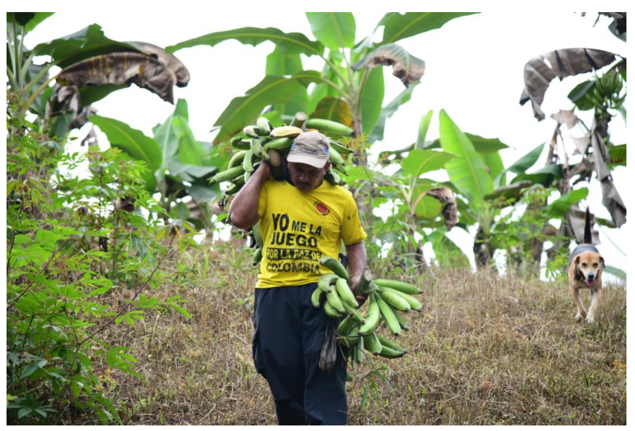
Colombia: In Tumaco-Nariño, southwestern Colombia, nearly 80 former combatants are growing pineapple, aloe, plantain, and lemon as part of their reintegration process.

In Colombia, attacks against former FARC-EP combatants have persisted, requiring strengthened prevention and investigation of incidents, as well as more fluid information-sharing on the provisions in the Peace Agreement that guarantee the security of former combatants. The United Nations Verification Mission in Colombia, with MYA funds, established a dedicated liaison capacity, based in areas with pressing security challenges, to support the Special Investigations Unit of the Attorney General's Office with contextual security analysis. This expertise also helps to identify the main risks faced by former FARC-EP combatants and proposes gender-differentiated prevention and protection strategies. These efforts contributed to enhance trust between former combatants and state institutions in charge of prevention, protection and investigation of violence against former combatants by making existing tripartite arrangements involving the Special Investigations Unit, the Verification Mission and FARC representatives more effective and sustained.