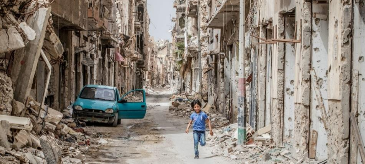
Libya: A child runs through the debris and wreckage in downtown Benghazi, Libya.

In the context of the Libya peace process, UNSMIL is facilitating three separate tracks of intra-Libyan discussions: security, political and economic. MSU assisted UNSMIL in its process of adaptation to the restrictions on direct diplomacy imposed by the COVID-19 pandemic and need to use digital tools to convene the virtual meetings of the intra-Libya talks and the Berlin International Follow-up Committee on Libya and its working groups. With the assistance of an external expert, MSU provided support in the area of digital process design and facilitation. Over the course of a three-week period in June, participants in the training exercise discussed preliminary options and the required skills in the context of the three main tracks of the Libyan process and agreed to continue working together to develop specific proposals and digital designs. As a result, the UNSMIL security team introduced and adopted various technological tools and techniques in the facilitation of the security track, under the umbrella of the 5+5 Joint Military Commission. In parallel, UNSMIL's political team continues to explore concrete options to promote dialogue among and engage the participants in the political track, including the Libyan Political Forum, using instant messaging systems and other digital platforms.