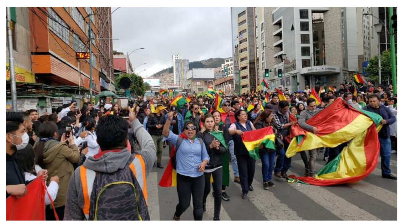
Bolivia: Demonstrators protest in the streets of La Paz, Bolivia.

For example, in Bolivia, elections that were expected to take place in May 2020 have now been delayed to the second half of the year. With MYA funding, DPPA is supporting virtual multi-party dialogues to prevent conflict and create an environment conducive to carrying out an inclusive, participatory and credible electoral process, including in the run-up to election day. The multi-party dialogues bring together electoral authorities and members of political parties and civil society to assist in clarifying queries. Over 50 dialogues had been held by July 2020, focusing on youth, elections, and the pandemic. The events have created awareness among the electorate, brought various actors/parties closer together, and contributed to the deescalation of conflict and a possible peaceful resolution through the elections.