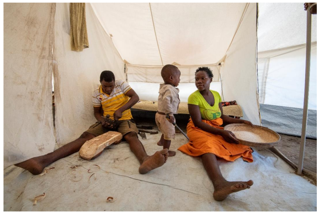
Mozambique: Family in their tent in the Taratara Camp, in Cabo Delgado province after Cyclones Idai and Kenneth.

In the second quarter, and due to COVID-19 and related travel restrictions, the Mediation Support Unit (MSU) provided remote operational support on mediation and dialogue initiatives to Special Envoys, peacekeeping operations, special political missions, resident coordinators, regional organizations and other partners, mobilizing its staff as well as the mechanism of the Standby Team of Senior Mediation Advisers. Remote operational support was provided in various settings, including Afghanistan, Costa Rica, Cyprus, Ecuador, Geneva International Discussions, Guatemala, Guinea, Libya, Mozambique, Papua New Guinea, South Sudan, Syria and Yemen. UN counterparts and partners were offered technical advice and targeted support on a broad spectrum of mediation and dialogue-related issues, including ceasefire arrangements, process design, transitional justice, gender and inclusion as well as constitutional reform, through remote online engagements, comparative analysis and options papers. Such support has assisted the design of processes to find entry points for engagement and overcome obstacles, helped identify possible options to address substantive issues, and built the capacity of mediation teams and national counterparts. Both MSU and the Standby Team are heavily reliant on MYA funding for their functioning and activities.