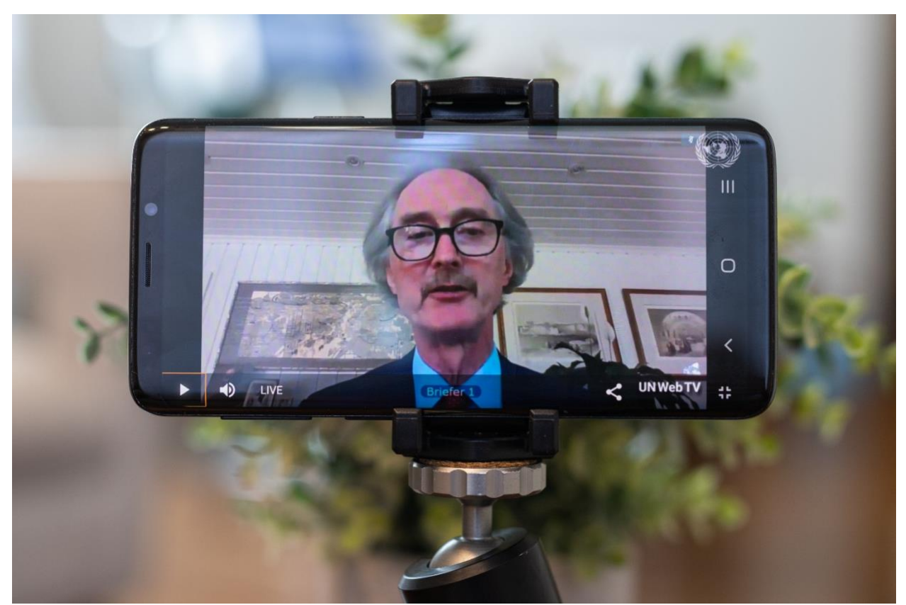
Syria: Special Envoy Geir O. Pedersen briefing the Security Council on the situation in Syria.

Brussels IV Conference: The Syria Team's engagement has ensured that the Conference reflects UN policy on Syria, including with regards to human rights, accountability and the political process led by Special Envoy Pedersen.