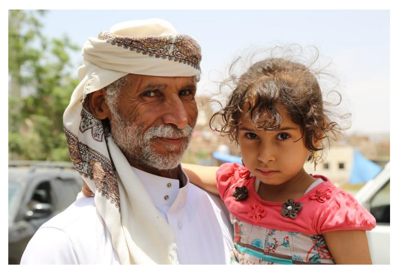
Yemen: Father and daughter, living with dozens of other IDPs in Sana'a, Yemen.

The session generated an action plan to elevate commitments to further promote women's participation and the integration of gender perspectives throughout the multi-track process. While the UN currently cannot host in-person meetings between Yemeni stakeholders due to COVID-19-related restrictions, OSESGY is conducting virtual meetings which offer possibilities for broadening participation and improving inclusion. In mid-June, the Office convened a virtual meeting focused on a genderinclusive ceasefire and community safety. More than 20 Yemeni women participated in the virtual consultation. Nearly three-quarters of the participants came from inside Yemen, including over 40 per cent from the south, and young women comprised 23 per cent.