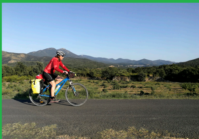
Example of regular cycle tourist

Minor section – unit of data collection corresponding to a section of the route with uniform or nearly uniform characteristics in terms of route component type, traffic speed and volume, surface, width and attractiveness of the area/landscape. Minor sections are typically between 200 m and 5 km long.