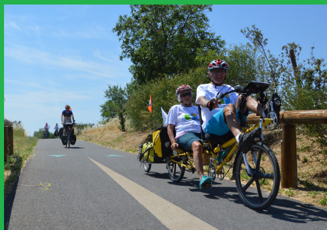
Example of demanding cycle tourists