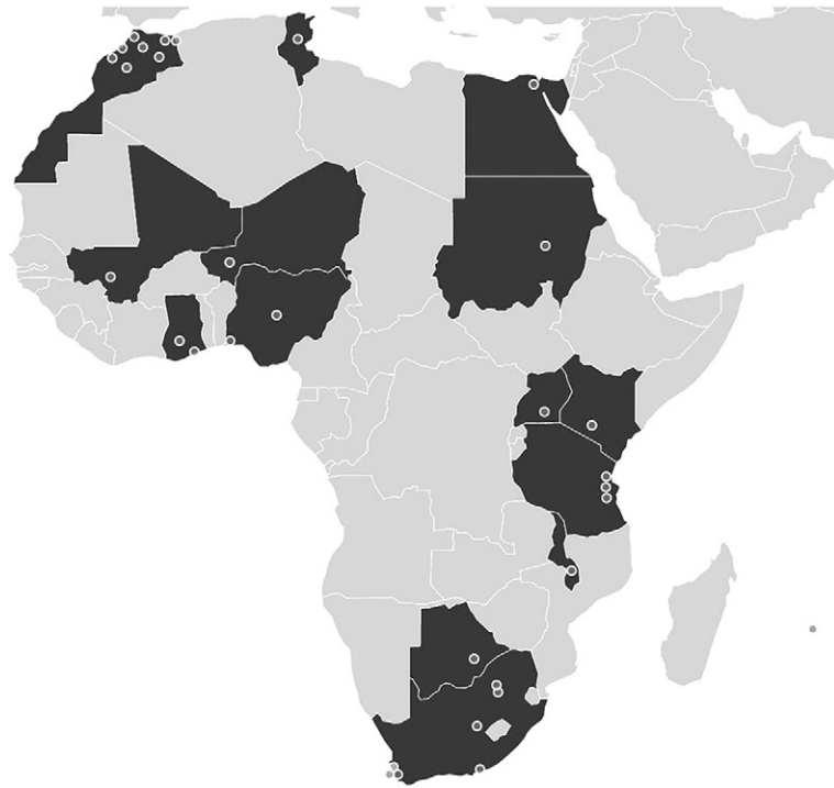
Figure 1. Map of Africa showing the distribution of nodes in the H3ABioNet network. The dot on the right is for Mauritius, and two additional sites not shown include one in the USA and one in the UK.

The mandate of H3ABioNet ( http://www.h3abionet.org/ ) is to develop and roll out a coordinated bioinformatics research infrastructure that is tightly coupled to a sophisticated pan-African bioinformatics training program. In modern genome sequence analysis, analytical tools are moving to where the high dimensional data are stored, so the expertise for genome data manipulation and analysis in Africa are being developed at the source of these data. The network seeks to exploit the development and implementation of best practices in genome bioinformatics in local centers while keeping an eye on the rapidly evolving field through collaboration with centers of expertise in