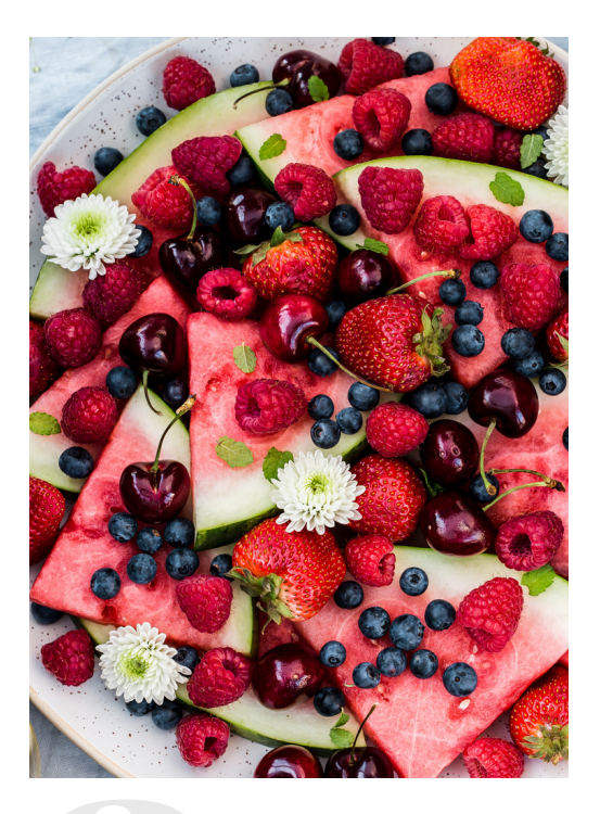
Red Fruit Platter Add a color coordinating fruit platter to the table, to nosh on.

Layer simple white plates with red or blue plates, and top with favor bags filled with colorful taffy.