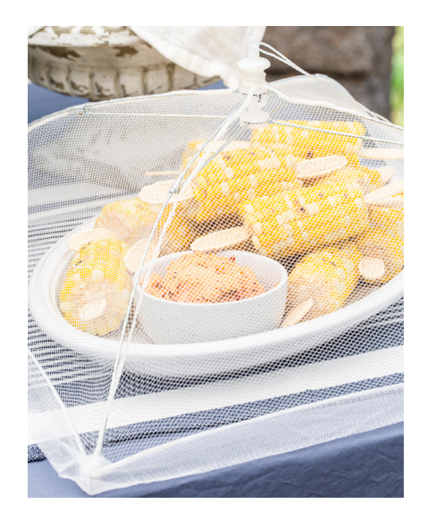
FOOD COVERS Use food umbrella covers to protect dishes from pesky bugs.