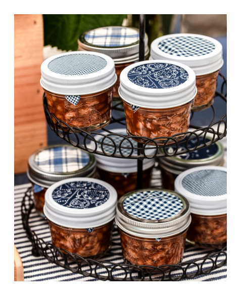
BEANS IN JARS Serve up baked beans in 4-ounce jars so guests can easily grab and go.

Are you new to entertaining or scared to cook for a crowd? Host an outdoor party, fire up the grill, and set up the <u>ultimate hot dog bar</u>! It's the perfect way to entertain because all the prep work is done ahead. When the party is underway you can grill the hot dogs and guests can choose their favorite toppings with an interactive buffet.