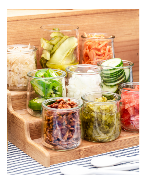
TOPPINGS DISPLAY Use a spice riser to hold hot dog toppings. Place toppings in small jars with spoons and tongs.