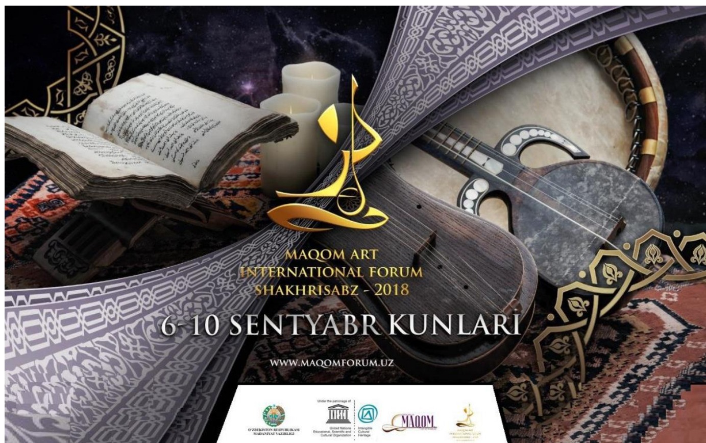
The sample of banners of the Maqom Art International Forum