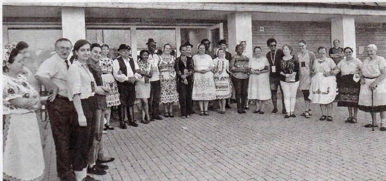
Az etióp delegáció tagjai remekül érezték magukat a Hagyományörzők Házában

vendégeket is a népviseletünk fogta meg a legjobban, ezért néhányukat felöltöztettek hagyományos kalocsaiba, és nem maradhatott el a rögtönzött táncház sem. Mint kiderült, más nemzetekhez képest rendkívül gyorsan sajátították el a lépéseket, ami feltehetően a kitűnő ritmusérzéküknek köszönhető, vélekedett, illetve annak, hogy a csapatban sokan eleve táncosok, a szentendrei programon bemutató Fendika táncegyüttes tagjai. A színekavalkádós ruházatok és a már-már arcpirító könnyedséggel megtanult táncok mellett a sajátos gasztronómiai remekeket értékelték a legjobban: a Hagyományörzők Háza becsinált levessel és fánkkaal várta a vendégeket. G. J.