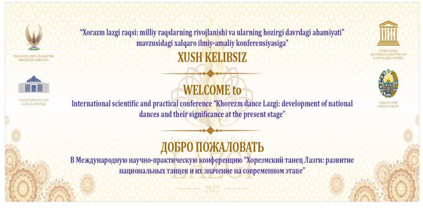
The sample of Certificates of the Lazgi International Dance Festival