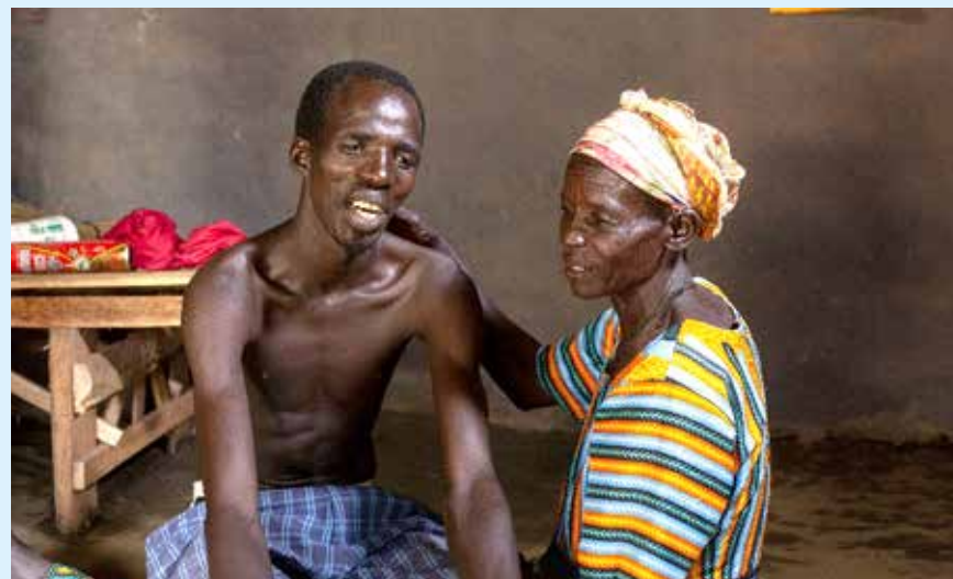
For the 3 days the boy stays with his mother in the hut, he has to sit on her just like a newly born baby