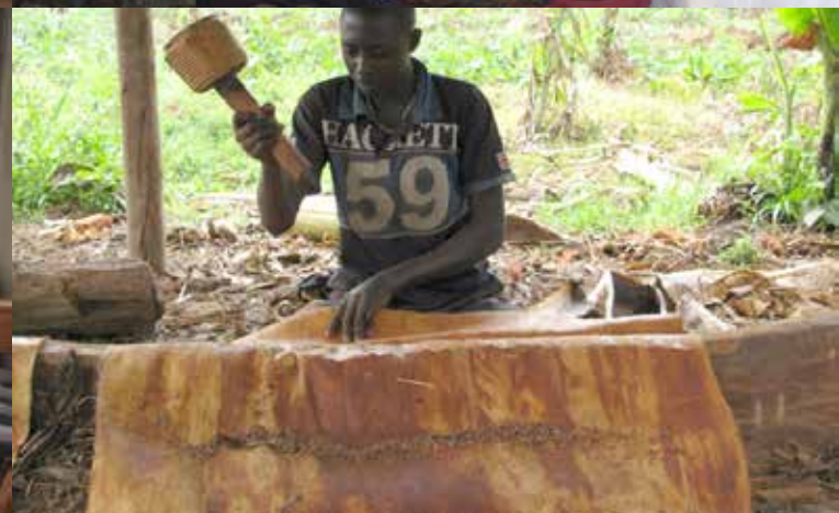
Bigwala trumpet music and dance, Male-Child-cleansing ceremony, Madi bow-lyre music and dance, Empaako naming ceremony, Koo-gere tradition and Bark cloth-making.