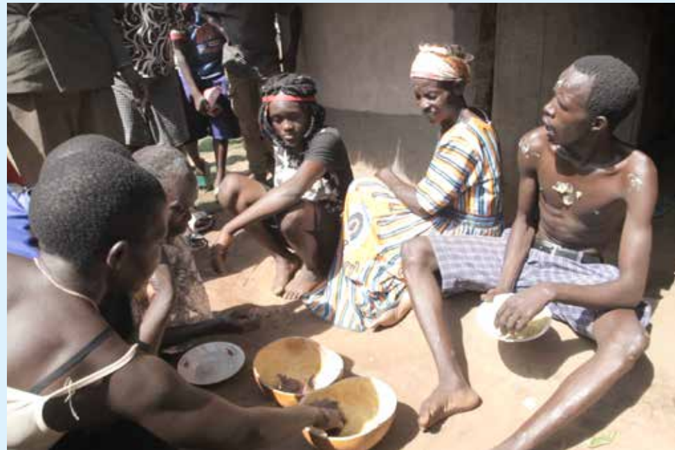
As part of the ceremony, a special meal is prepared and eaten at the doorway as soon as they come out of the house