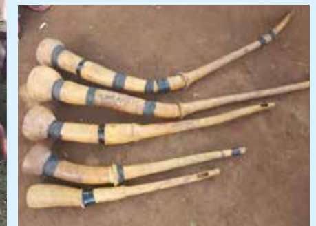
A set of Bigwala music and Dance