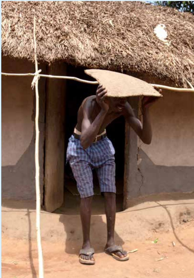
The Male Child only gets out of the house covering his head with a winnower