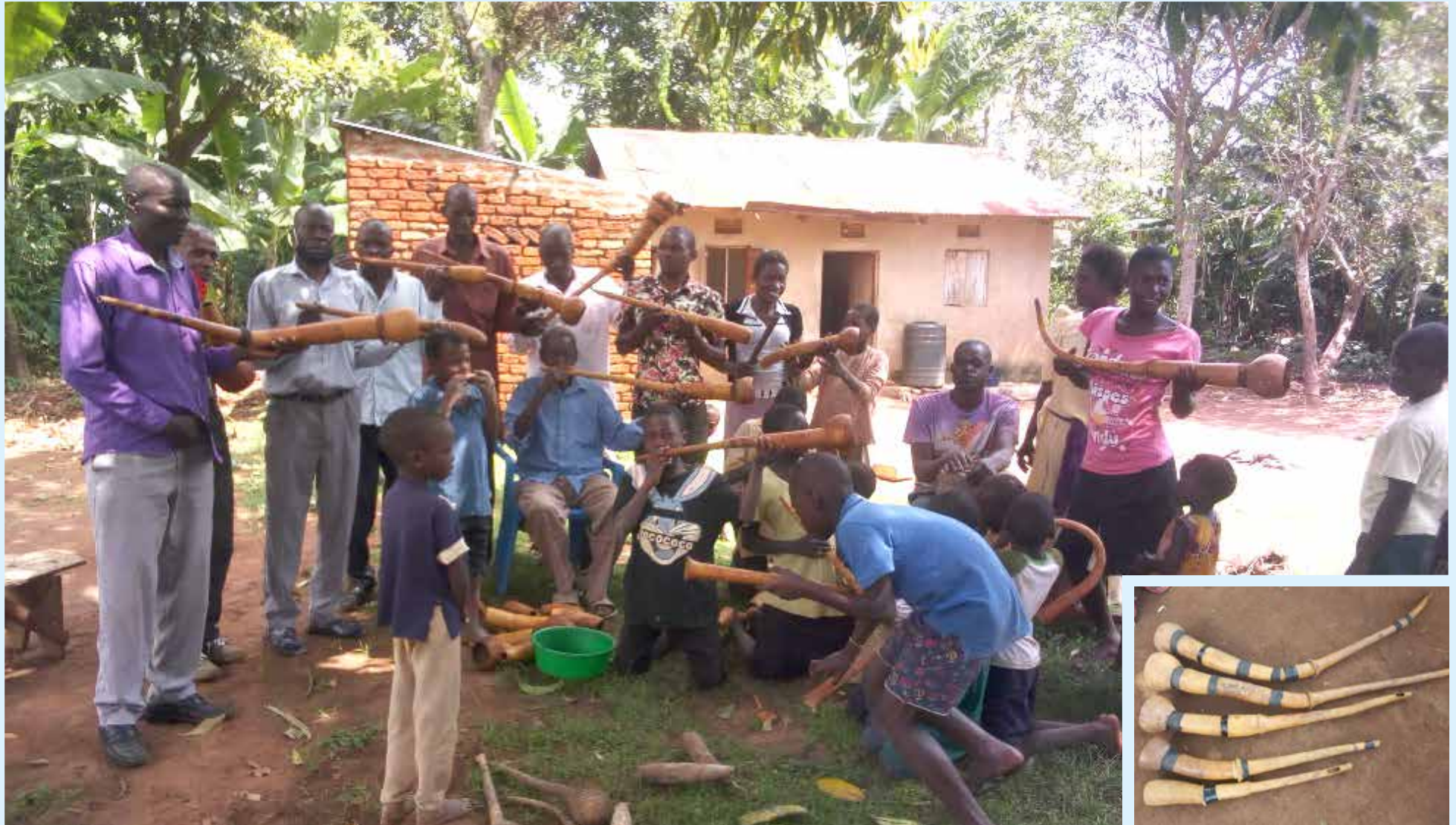
Bigwala Trumpet music and dance troupe organising to perform