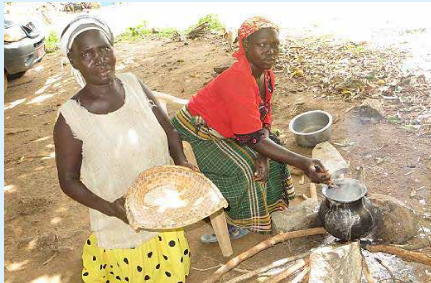
A special meal is prepared by women while the men are making a Bowl Lyre, an O'di