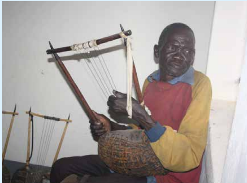
The owner of the newly made Bowl Lyre shakes it first, giving it respect, and plays it first.