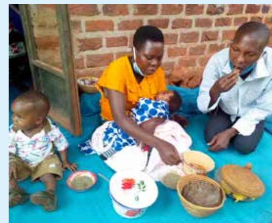
Clock wise: The child to be named is handed over to its grand parents. 2. If the child is a baby girl, the grand mother names it. 3. A special meal is prepared and the father and mother of the baby are special visitors