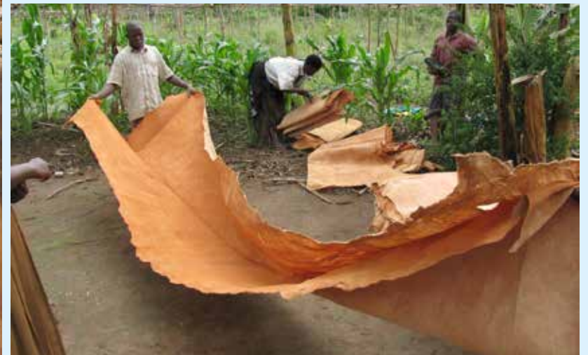
1. Using a mallet to make a bark cloth out of a bark of a tree. 2. Plucking a bark off a tree to make a bark cloth. 3. Dry bark cloth ready for sale