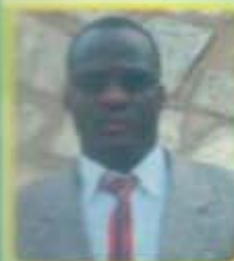
Mr. William Nyakatura

Former Minister, Republic of Uganda Member of district Public service Commission Minister of Health Tooro Kingdom