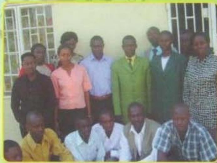
All EZT staff and Volunteers as at 30th July 2007

At grass root community levels, EZT is represented by a network of Programme Agents, Community based trainers and Entrepreneurship Promoters. These are groomed by the