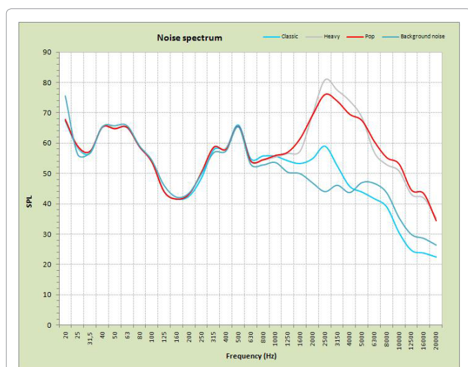
Figure 2: Frequency spectra of the measurements taken within the incubator for the three different music styles and the background noise. Sound pressure level (SPL) is measured in decibels (dB).

used. A sound calibrator CESVA CB-5 was also used. Background noise in the incubators was measured to determine possible interference or influence with the music. In all cases, the volume of the music played was the maximum possible for the piece of equipment used. Equivalent continuous sound pressure levels ( L_{eq} ) were measured in thirds of octave spectral distribution.