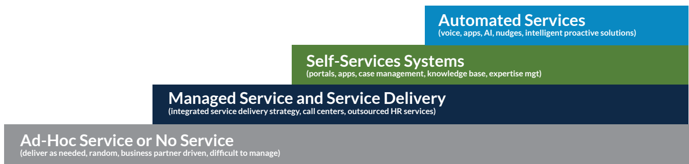
Figure 2 The Evolution of the Employee Experience Market