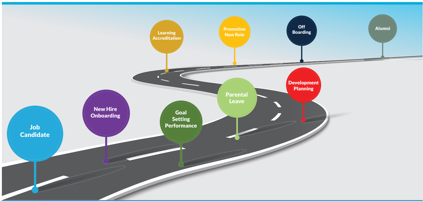
Figure 1 Employee Journey

technologies, company initiatives, or business transformations – can seem almost continuous. In the most sophisticated companies, new employee onboarding is now a multi-month journey, with different types of developmental experiences along the way.