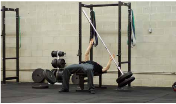
It's not pretty, but learning how to dump the weight will save you from getting trapped if you're benching without a spotter.