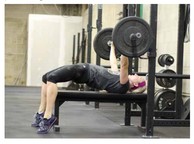
Bridging is not acceptable. Keep your feet flat and your butt locked to the bench.

With your wrists locked, lower the bar in a controlled manner until it touches a point right at the end of your breastbone. When the bar touches your chest, pause for a 1-second count. If you learn to do this from the very beginning, you'll be way, way ahead when you start handling demanding poundages or decide to enter a powerlifting contest.