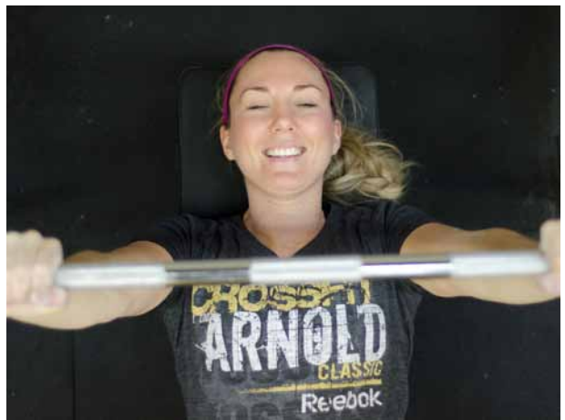
The bottom position should be near the end of the breastbone, and the bar will sweep back slightly as you press it up.

"How much can you bench?" is the question now asked to find out how strong a person might be. Personally, I believe knowing a person's incline, front-squat or deadlift numbers are more important when I want to know a person's level of strength.