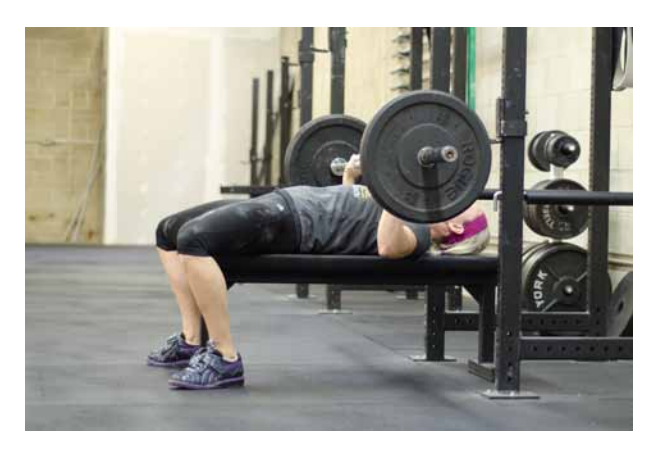
Holding your breath during the entire bench press will help you maintain a solid foundation, essential when pressing big weight.

You need to hold your breath during the execution of the bench press. Inhaling or exhaling while the bar is in motion forces your rib cage to relax, thereby preventing you from maintaining a rock-solid foundation. Here's the correct breathing procedure: take the bar from the rack, lock your arms, set yourself and take a deep breath. Lower the bar to your chest, pause, drive the bar to lockout and exhale. If you exhale too soon, that rep is going to be much harder to complete. Do the same thing for all the reps.