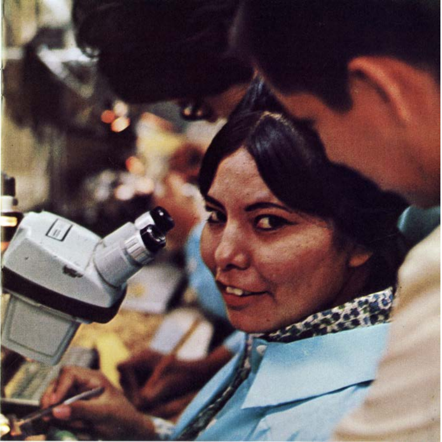
Figure 3. Shiprock Dedication Commemorative Brochure , September 6, [1969], lot X5184.2009, folder 102725169, Computer History Museum, Moun- tain View, CA.

merely a different material iteration of the same pattern or aesthetic tradition found within the integrated circuit. The opposing page states, “The blending of innate Navajo skill and Semiconductor’s precision assembly techniques has made the Shiprock plant one of Fairchild’s best facilities—not just in terms of production but in quality as well.”