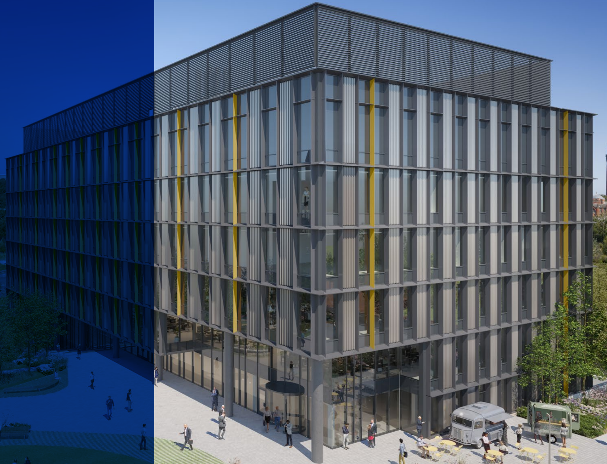
University of Birmingham: Birmingham Health Innovation Campus (BHIC).