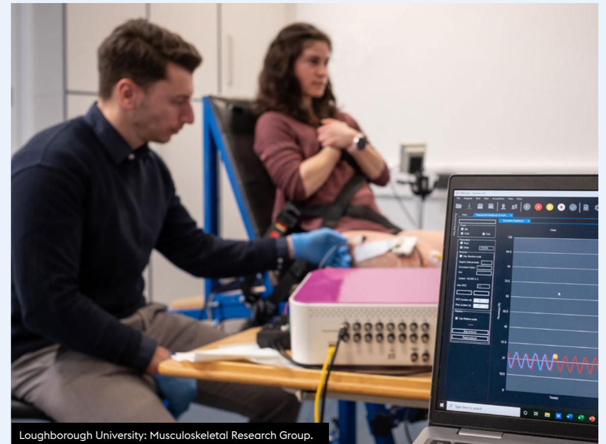
Loughborough University: Musculoskeletal Research Group.

The Midlands hosts one of the world's largest Arm-based supercomputer deployments and the UK's largest IBM Power9 AI cluster.