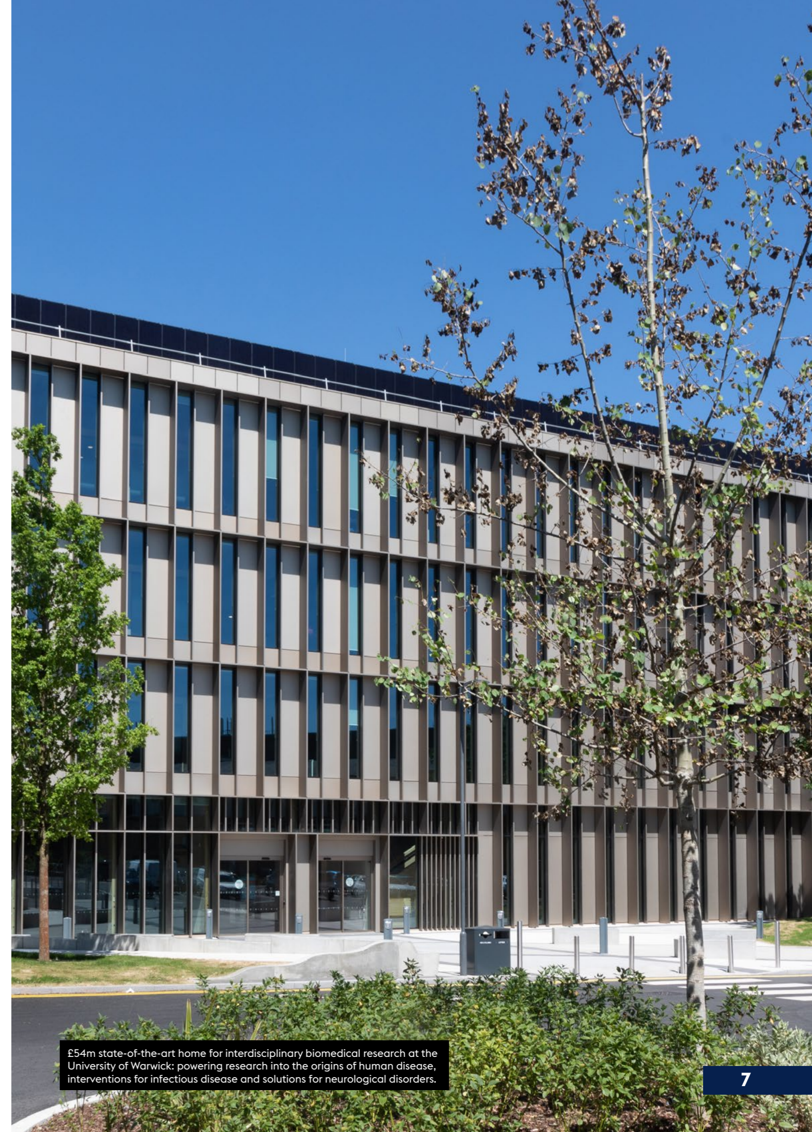
£54m state-of-the-art home for interdisciplinary biomedical research at the University of Warwick: powering research into the origins of human disease, interventions for infectious disease and solutions for neurological disorders.

The highly connected and integrated nature of the region's universities with our health and social care system provides the ability to respond rapidly to critical community needs. We can easily share knowledge, resources and infrastructure with hospitals and healthcare and social care providers, and develop skills in-situ that meet the needs of local health services and businesses.