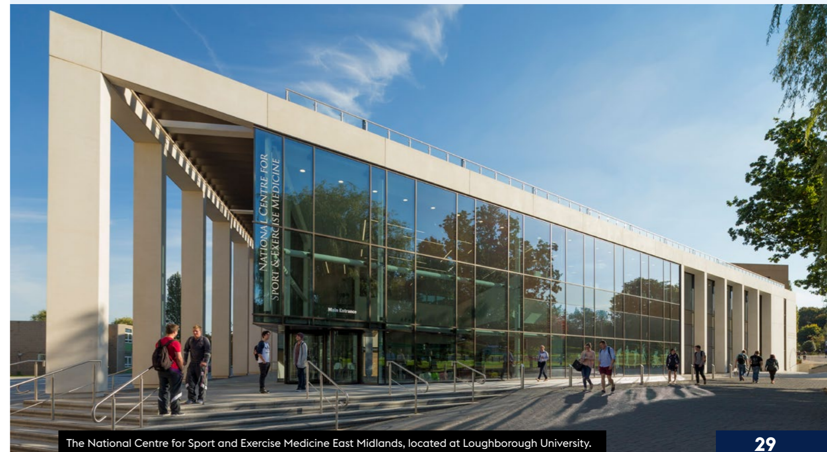
The National Centre for Sport and Exercise Medicine East Midlands, located at Loughborough University.