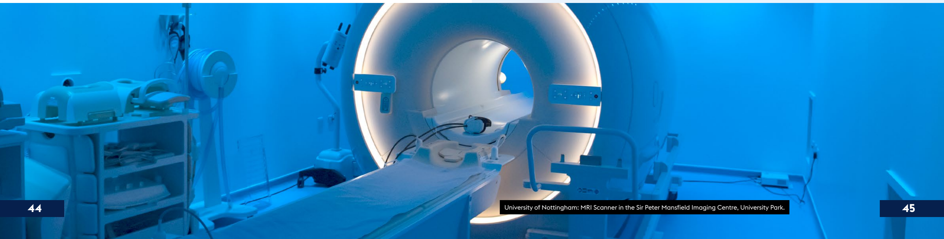
University of Nottingham: MRI Scanner in the Sir Peter Mansfield Imaging Centre, University Park.