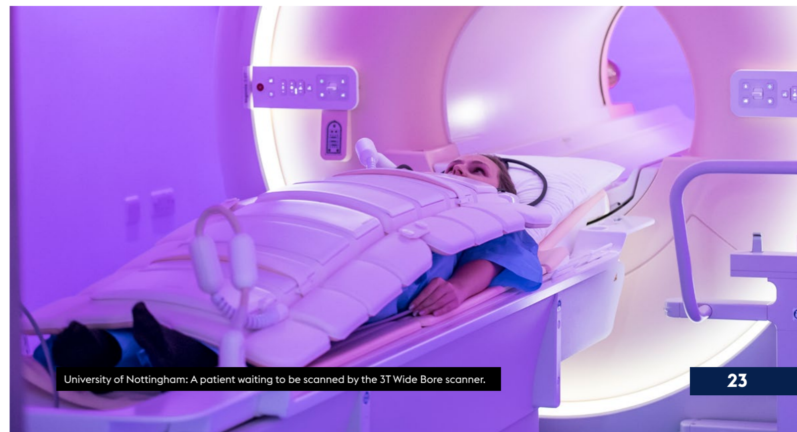
University of Nottingham: A patient waiting to be scanned by the 3T Wide Bore scanner.

MedTech in the Midlands supports over 23,000 jobs, in 1,000 companies, creating £1.6bn GVA annually