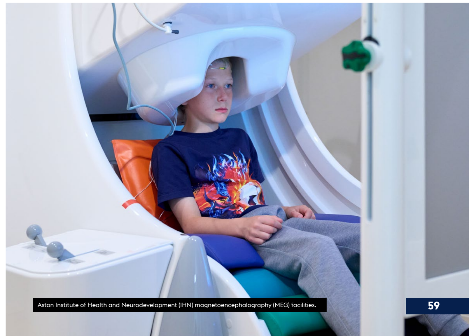
Aston Institute of Health and Neurodevelopment (IHN) magnetoencephalography (MEG) facilities.