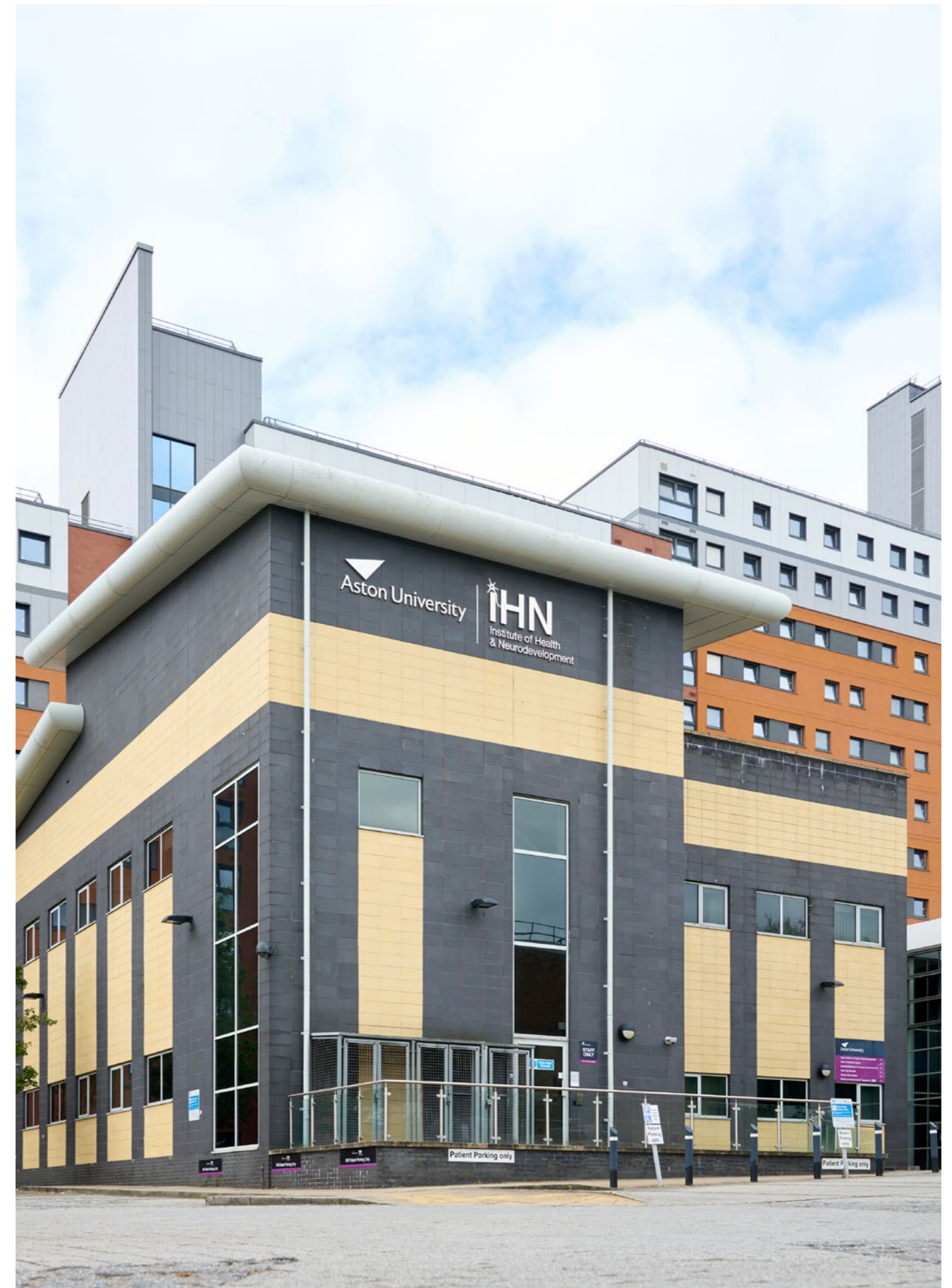
Aston Institute of Health and Neurodevelopment building.