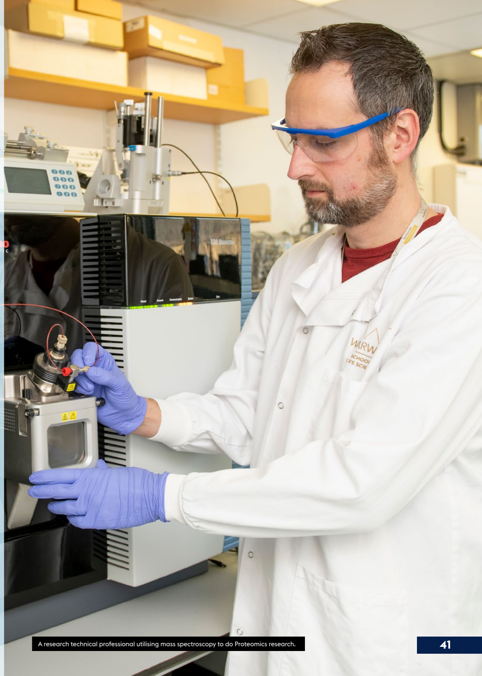
A research technical professional utilising mass spectroscopy to do Proteomics research.