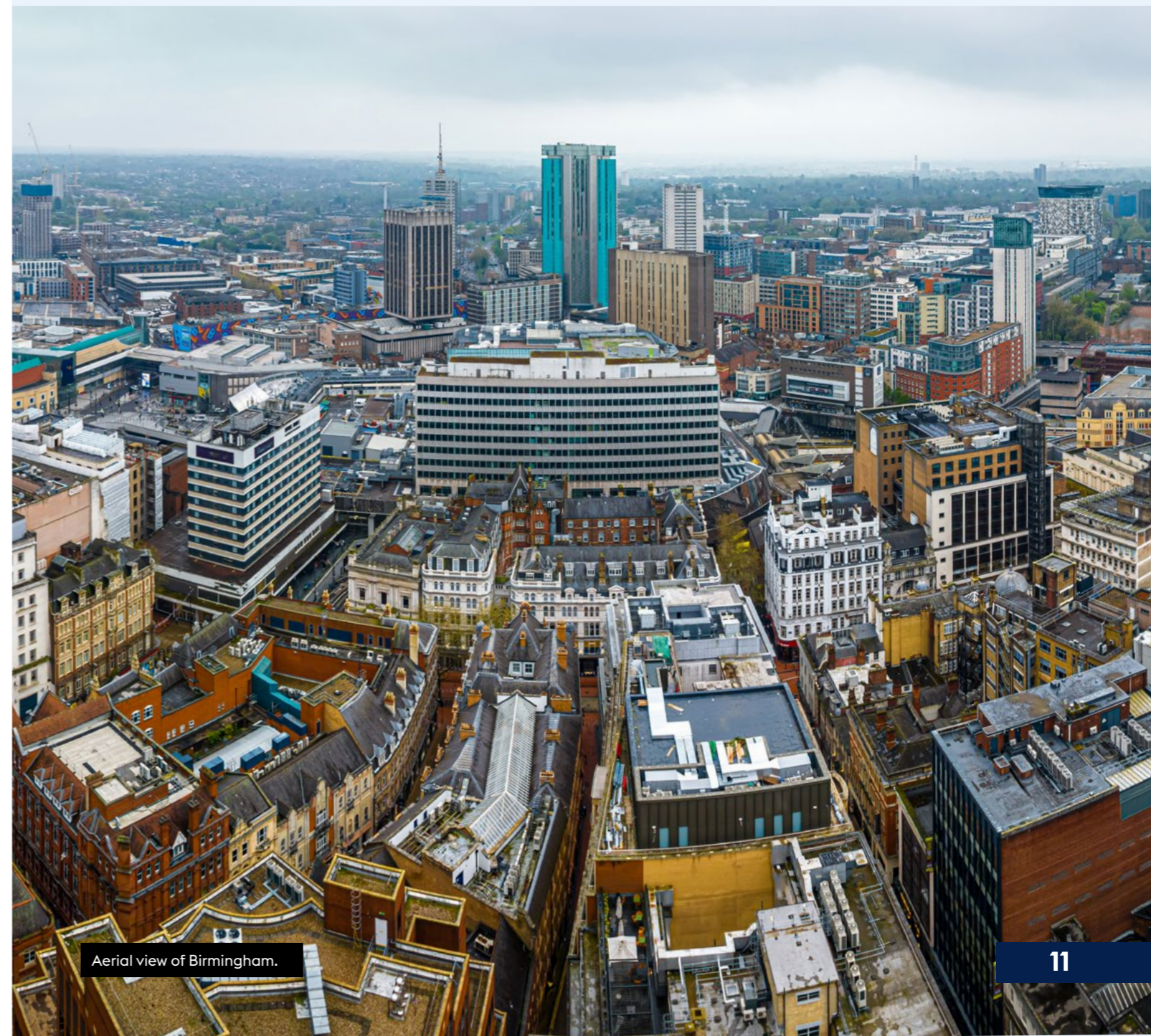
Aerial view of Birmingham.

Health and Life Sciences is a growing super cluster within the Midlands, with 93% company growth in the last decade. With 420 businesses incorporated since 2017 and 34 spinouts currently being tracked, the growth looks set to continue. Prominent cluster locations are Birmingham and Nottingham. There are established organisations such as Medilink Midlands and the Health Innovation networks, dedicated Life Science Opportunity Zones in Birmingham and Charnwood at Loughborough, as well as private incubator spaces such as BioCity in Nottingham: there is a robust cluster support infrastructure across the region for any life sciences investor looking to innovate, research and grow their business.