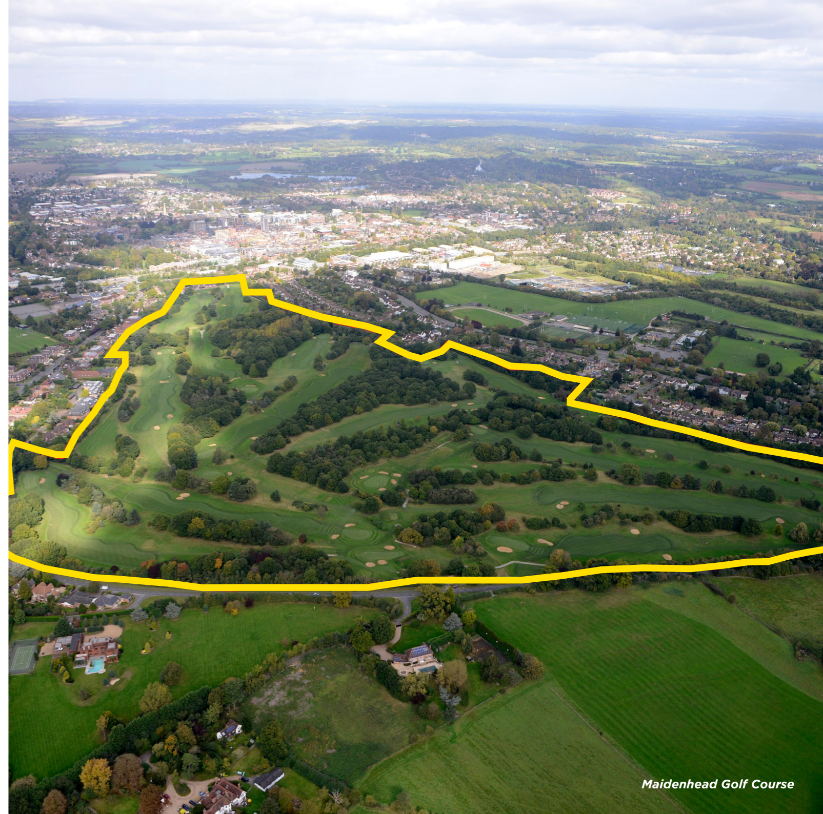
Maidenhead Golf Course