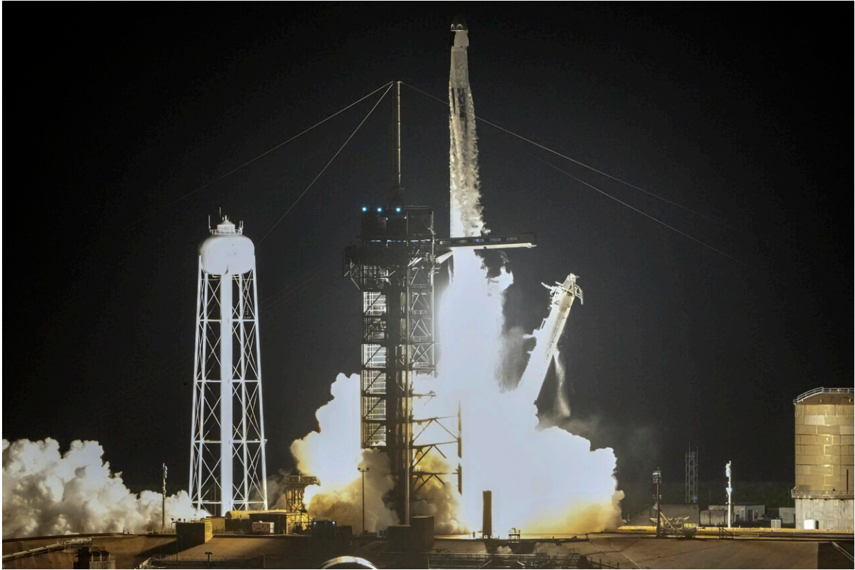
A SpaceX Falcon 9 rocket with a crew of four lifts off from pad 39A at the Kennedy Space Center in Cape Canaveral, Fla., Tuesday, Sept. 10, 2024.