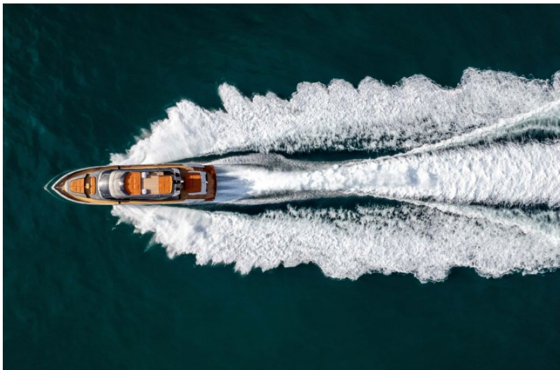
MAN engines, with their excellent power-to-weight ratio, contribute exactly to the DNA of AB Yachts and Maiora. Pictured is the AB80 with three MAN V12-2000s.