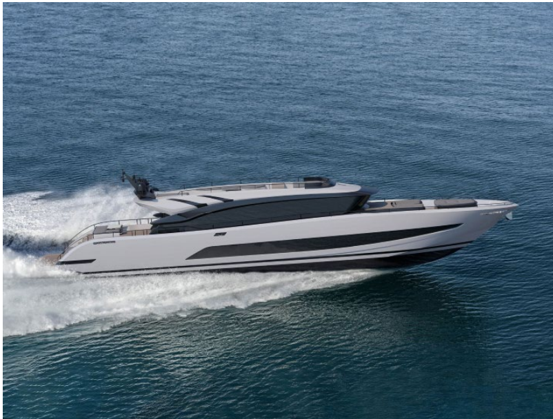
MAN Engines is equipping other AB Yachts and Maiora series with engines in the upper power range. Pictured is the brand new AB110 with three MAN V12-2000 engines.